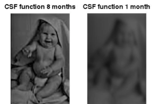
Figure 2. Simulations of different contrast sensitivity functions.