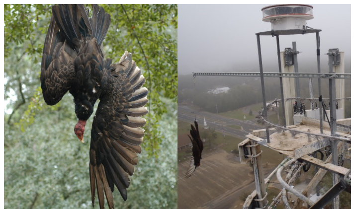
Figure 8. Installation of an effigy is effective for dispersing a vulture roost.

Regardless of the type, proper installation is crucial. Display the carcass or effigy from a high, prominent location so that birds using the roost notice it. Hang the stimulus upside down by its feet, far enough from branches or other points of contact to prevent entanglement. Hire a professional to install the carcass or effigy on a tower