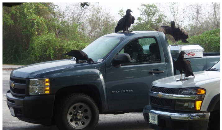
Figure 3. Damage by black vultures to structures, vehicles and other property is a common occurrence.

In addition, vultures can cause human health and safety problems by contaminating water sources with their droppings. Contamination has occurred when coliform bacteria from droppings entered water towers or springs from which residences drew water.