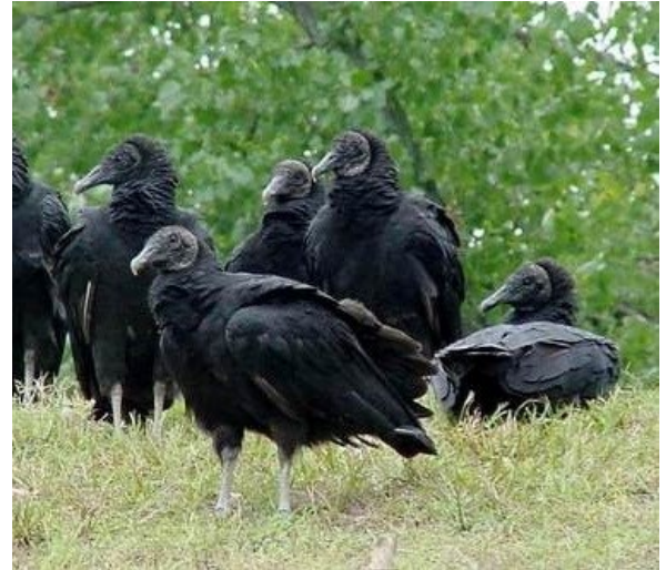
Figure 1. Black vultures ( Coragyps atratus ) are very social with an extended period of parent-offspring interaction.

Martin Lowney State Director USDA-APHIS-Wildlife Services Lakewood, Colorado