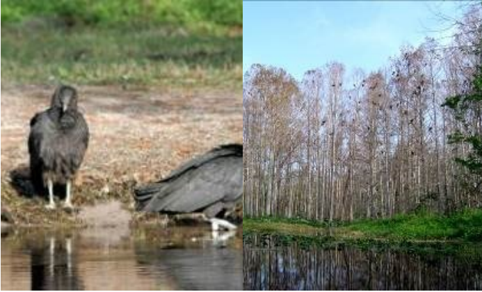
Figure 16. Black vultures often roost and forage near water.