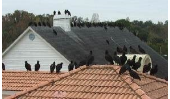
Figure 4. Vultures frequently loaf or roost on buildings and other structures where accumulations of droppings create nuisance and health concerns.

Vultures are attracted to roost sites for reasons largely unknown. Altering the vegetation structure of a given roost may affect the thermodynamic properties of the site. Therefore, thinning branches on trees within the roost or removing some trees to open up the roost site could reduce the attractiveness of the site for roosting birds. This method likely will be difficult to apply in most cases, as preservation of trees is frequently an important goal in communities. Furthermore, there are no proven guidelines for how best to thin or modify roost vegetation to discourage vultures. Vultures may repeatedly be attracted to a site due to the abundance of a stable food supply. The proper disposal of dead livestock and removal of other human-made foods may reduce vulture use of some areas.