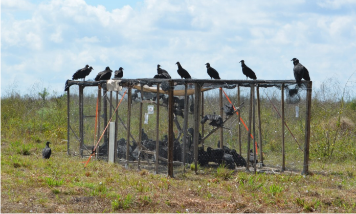
Figure 11. Baited walk-in traps are effective for capturing large numbers of vultures.