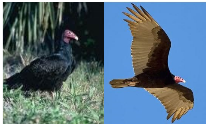
Figure 12. Turkey vultures ( Cathartes aura ) are characterized by long, narrow wings, a relatively long tail, and a red head (in adults).

and glide when at low altitudes, whereas black vultures flap frequently, interspersed with brief glides when at low altitudes unless a strong wind blows. At high altitudes both vultures primarily glide when riding thermal wind currents.