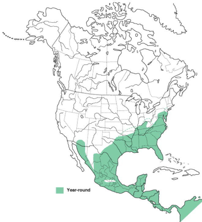
Figure 15. Black vulture distribution in North America.