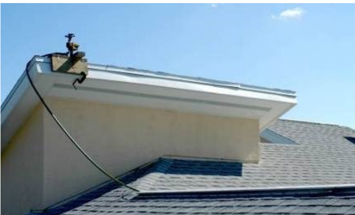
Figure 10. Motion-activated sprinklers are effective for scaring vultures from rooftops, boat docks, and other places with access to a source of pressurized water.

To be most effective, harassment must be diligent and constant, and initiated as soon as the problem is recognized. The use of a variety of harassment tools at the same time increases the likelihood of dispersing vultures. To disperse a roost, begin harassment at dusk as the vultures come to roost and continue until dark. Harassment on several consecutive nights may be required to disperse a roost. Normally, it takes 7 to 9 consecutive nights of harassment to disperse a vulture roost when 15 mm and 12-gauge pyrotechnics are used alone or with propane can-