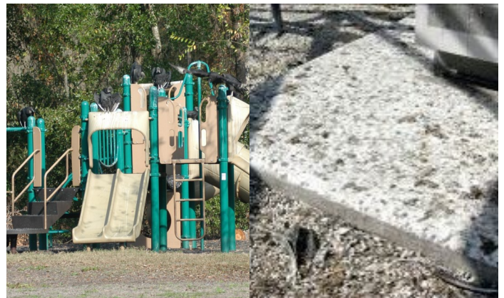
Figure 6. Fecal material from vulture roosting and loafing can render facilities such as playgrounds unsafe and unappealing. Fecal accumulation, feathers, and regurgitated pellets signify presence of a vulture roost.