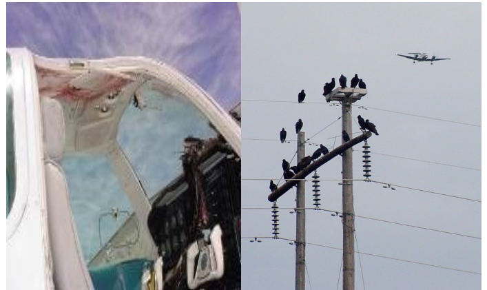
Figure 5. Vultures represent major safety hazards to civil and military aircraft.