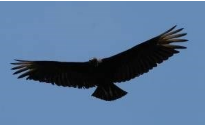
Figure 13. Black vultures have a black head and broad white-tipped wings.