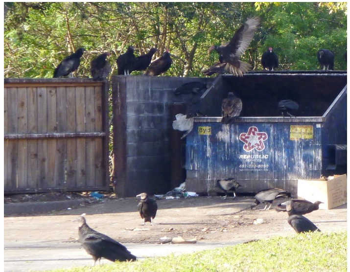
Figure 17. Vultures exploit feeding opportunities created by human activity.

On a smaller scale, black vultures often plunder dumpsters and garbage cans, and they frequent waste transfer stations, zoos, and any place where food scraps are regularly available (Figure 17). Both species are adaptable and capable of exploiting feeding opportunities created by human activity.