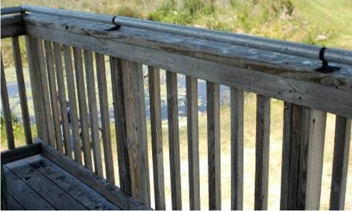
Figure 7. The Coyote Roller® can be an effective device for preventing vulture perching.

Vultures may use a site for multiple reasons, however, and the removal of a food source might be insufficient to disperse vultures roosting or loafing at a site.