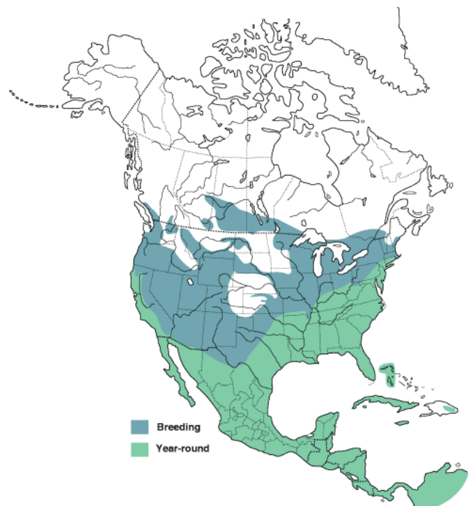
Figure 14. Turkey vulture distribution in North America.

Black vultures make a low-pitched grunt or “woof,” audible at close range, when disturbed.