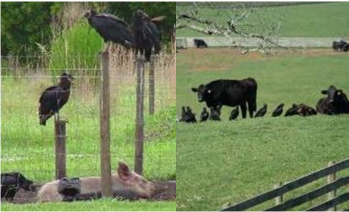
Figure 2. Livestock producers must be vigilant because black vultures are known to kill and injure vulnerable animals, especially newborns and those giving birth.

appropriate, and experience has shown that best results are obtained if the source roost can be dispersed.