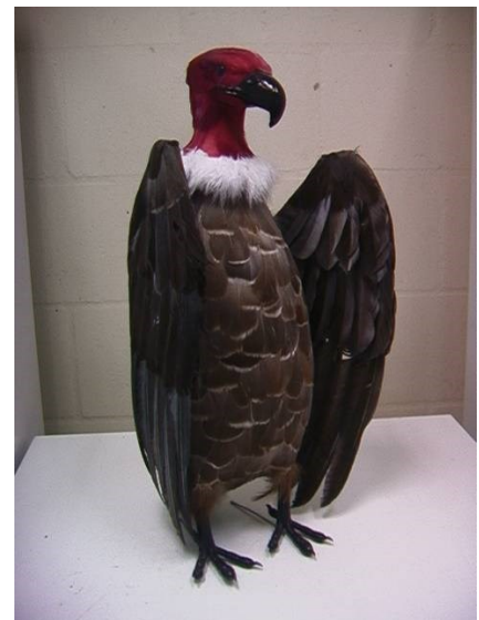
Figure 9. Artificial vulture effigy used for roost dispersal is made in China and can be purchased online.

The likeness is approximately 16.5 inches tall. The body is covered with brown feathers and the head is red. The effigy has been used to disperse vulture roosts from trees, towers, refinery plants, and power plants.