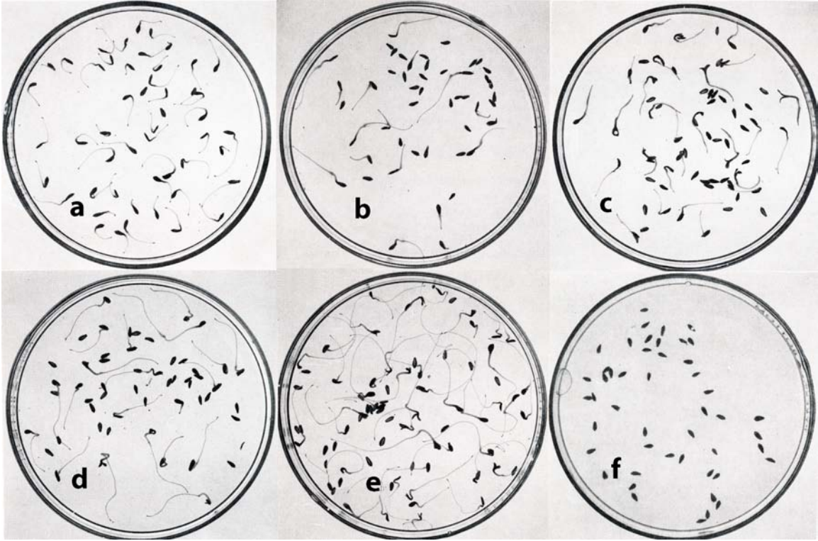
Figure 6. Petri dishes showing the effect of different wavelengths of light on lettuce seed germination. Grand Rapids lettuce seeds were germinated by placing them on moist filter paper and exposing the moist seeds to light at least three days in advance, and then flooding them with ethanol to kill and fix the seeds. Fifty seeds were placed in each of six Petri dishes exposed to the following light conditions: a light, b dark, c blue, d green, e red, f far-red. (CREDIT: Postlethwait & Biological Sciences Curriculum Study, 1976, p. 99-102)