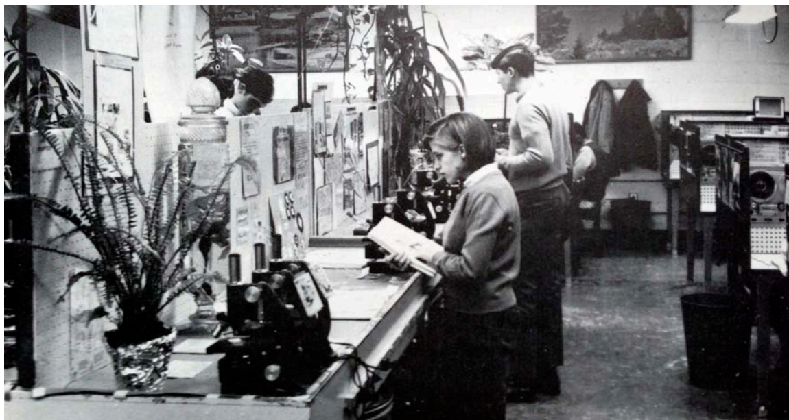
Figure 3. A photograph of students working during one of Sam's laboratory sessions, by Sam. (CREDIT: Postlethwait & Biological Sciences Curriculum Study, 1976, p. x)