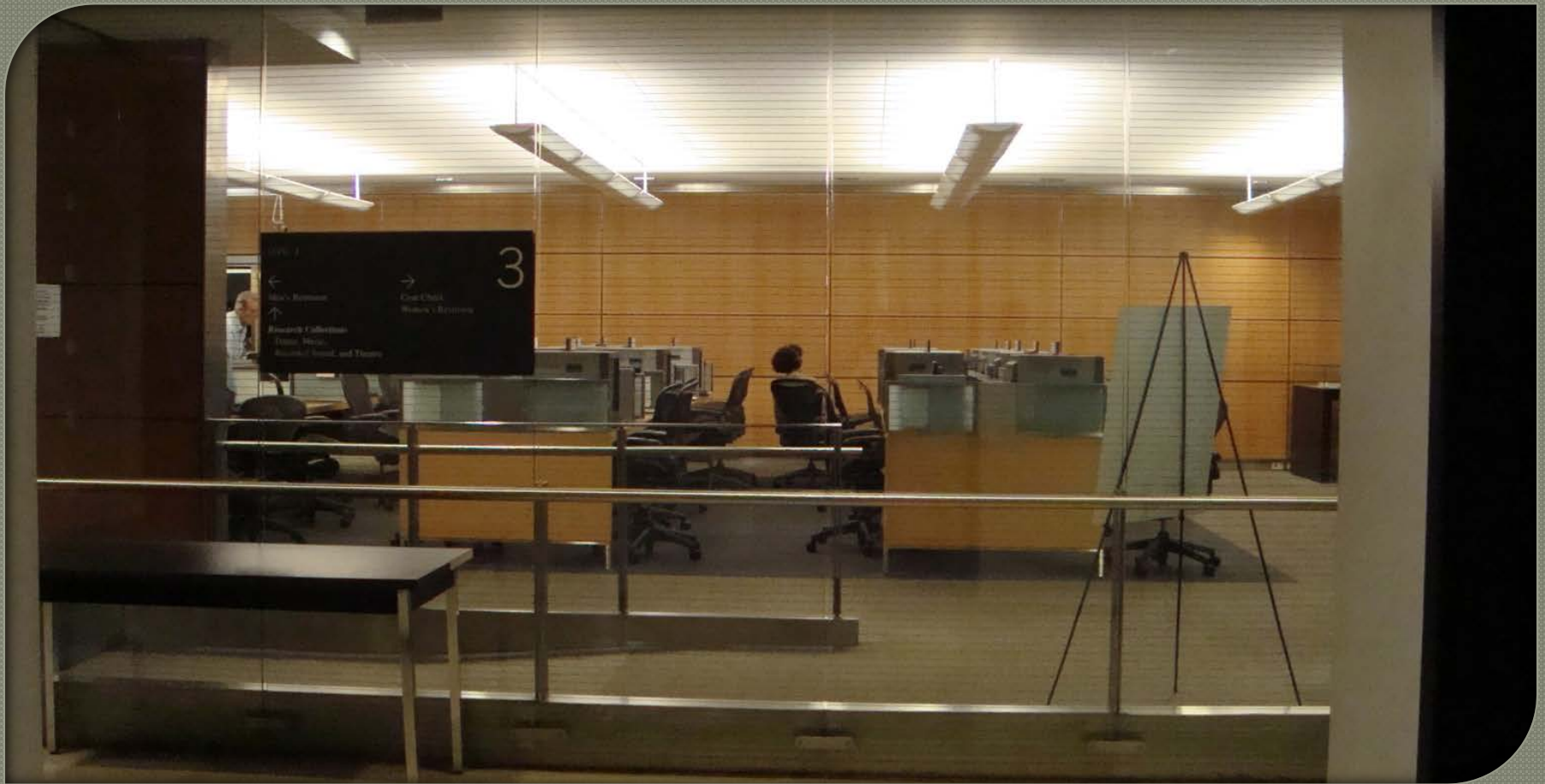
Jerome Robbins Dance Division