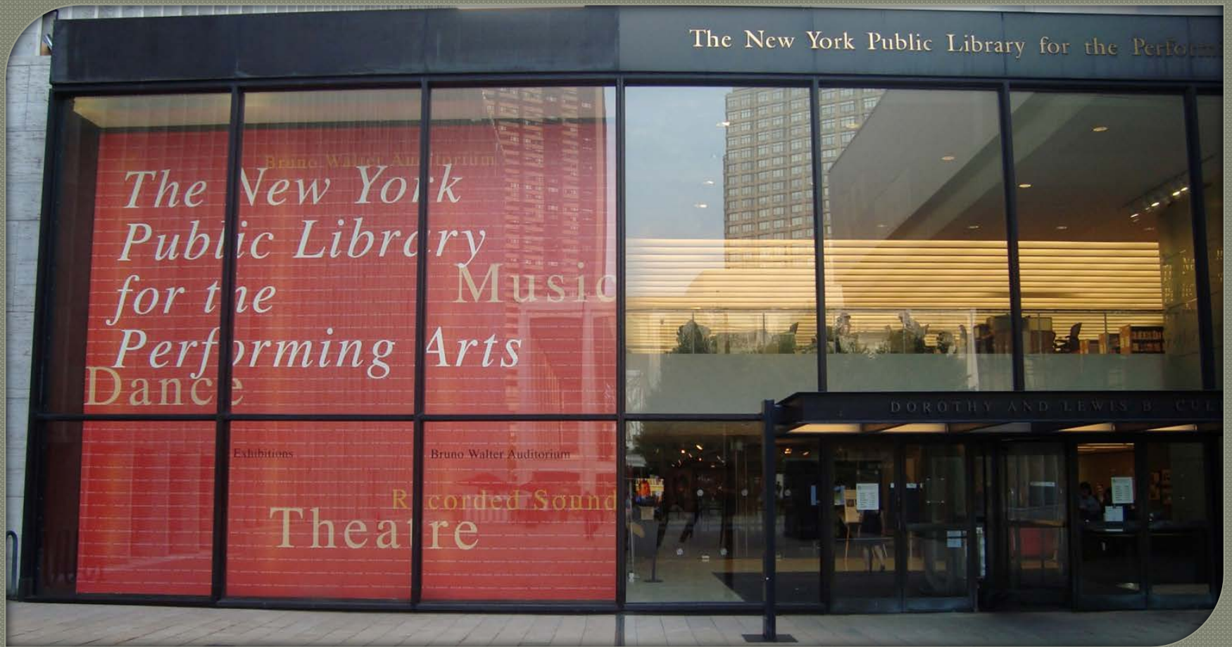
New York Public Library for the Performing Arts