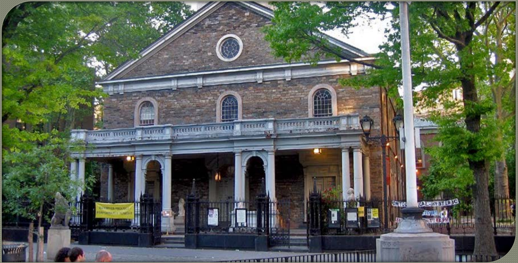
St. Mark's Church In The Bowery