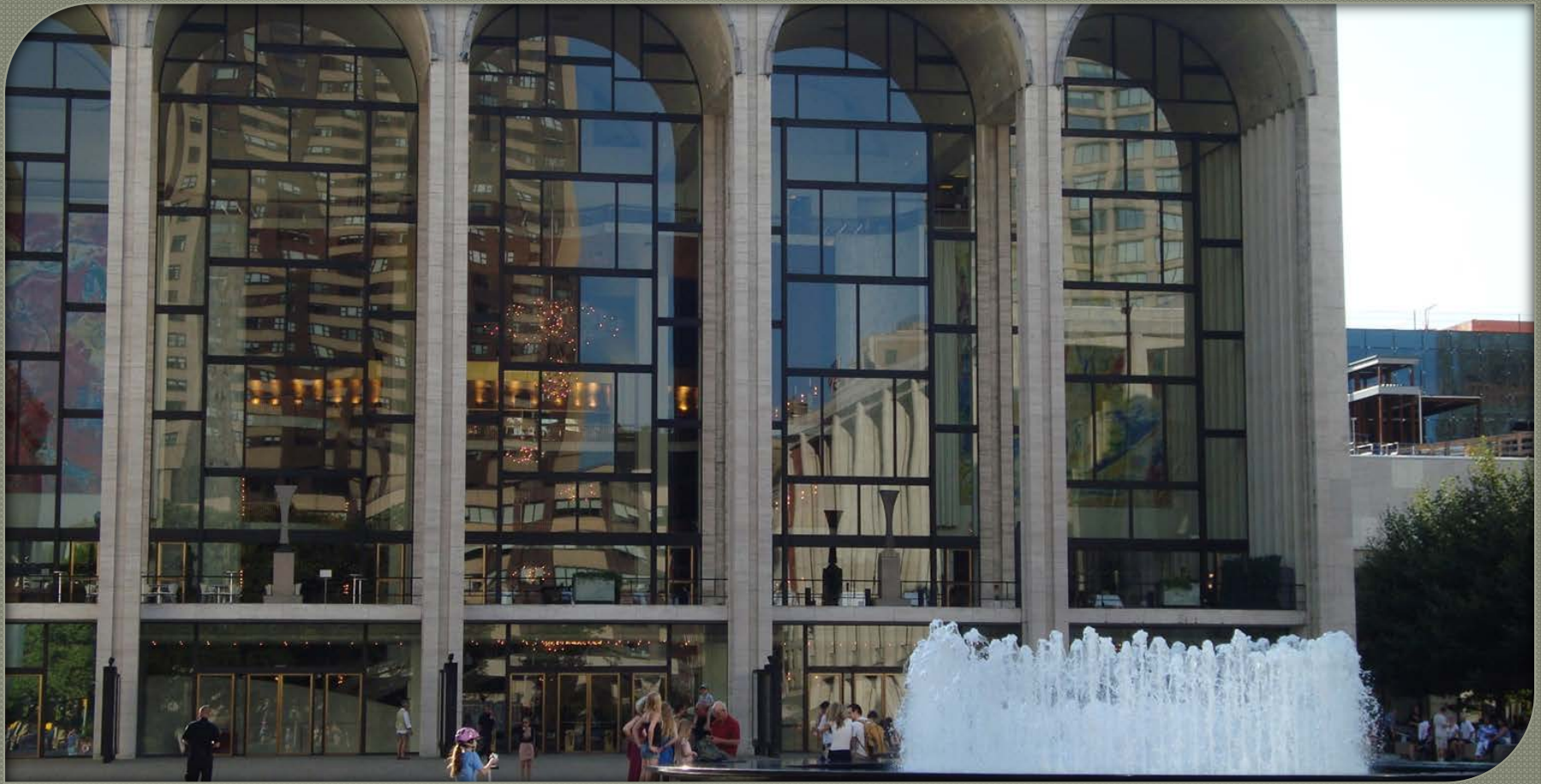
Lincoln Center, New York City