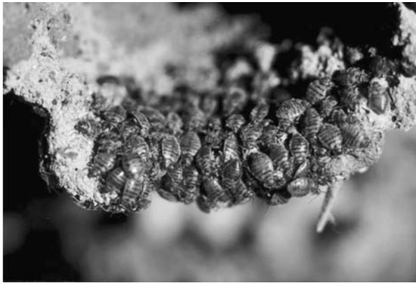
FIG. 1. Swallow bugs ( Oeciocacus vicarius ) clustering at the entrance of an unused cliff swallow nest, apparently in attempts to disperse on the legs or feet of a bird.

overwinter in cliff swallows' nests or in the cracks and crevices of the nesting substrate near the nests. Infestations can reach 2600 bugs per nest, and the bugs affect many aspects of cliff swallow life history (Brown and Brown 1986, 1992, 1996, Chapman and George 1991, Loye and Carroll 1991). Swallow bugs begin to reproduce as soon as they feed in the spring. Eggs are laid in several clutches that hatch over variable lengths of time, ranging from 3–5 days (Loye 1985) to 12–20 days (Myers 1928). Bug populations at an active colony site increase throughout the summer, reaching a peak at approximately the time nestling cliff swallows fledge. The bugs seem to be adapted to withstanding long periods of host absence, in some cases for up to three consecutive years (Smith and Eads 1978, Loye 1985, Loye and Carroll 1991, Rannala 1995). Bugs also parasitize introduced house sparrows ( Passer domesticus ) that occupy nests in some cliff swallow colonies (Hopla et al. 1993, Brown et al. 2001). Swallow bugs disperse between nests within a colony by crawling on the substrate and disperse between colony sites by clinging to the feet and legs of cliff swallows that move from one site to another (Brown and Brown 2004a).