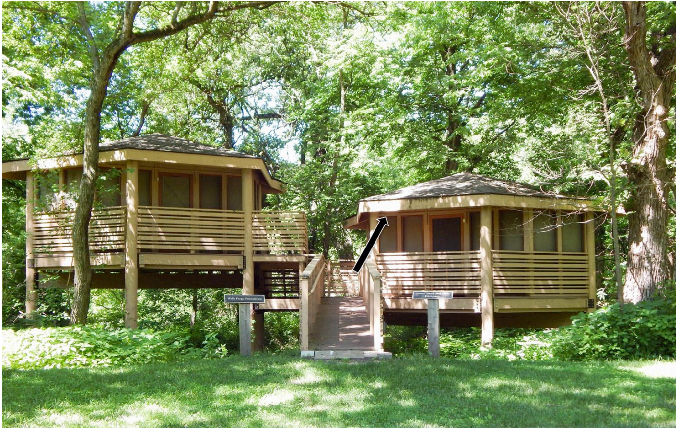
Figure 1. A pair of “sky cabins” at Camp Catron and Retreat Center in Otoe County, Nebraska where a colony of Northern Long-eared Myotis ( Myotis septentrionalis ) roosted in summer and fall 2014. The arrow shows the general location of the roost, but the opening to the roost is hidden by the overhang of the roof. Bats used this roost from 23 July to at least 8 October.

On 21 June 2014, we first documented and identified bats as a maternity colony of M. septentrionalis (three adults and one juvenile). Subsequently, we visited the site 11 additional times from 5 July to 6 November 2014. On each visit, we searched the outside of each cabin during the day for roosting bats. On seven visits we conducted emergence counts to determine the number of bats using the cabins. On one visit (5 July), we counted bats as they emerged from the roost. A video camera (Handycam HDR-XR200, Sony Corporation, Tokyo, Japan) and infrared lights were used to count bats as they emerged on four additional visits (12 August, 13 August, 3 September, and 8 October); however, on 12 August bats began emerging before the camera was recording, on 3 September an infrared light failed and it was too dark to easily see bats on video, and on 8 October at least one bat was still in the roost after we finished recording. Thus, the only night when we likely recorded all bats emerging from the roost was 13 August. During two visits (14 and 22 September), a camera triggered by an infrared sensor was used to photograph emerging bats. On the last visit (6