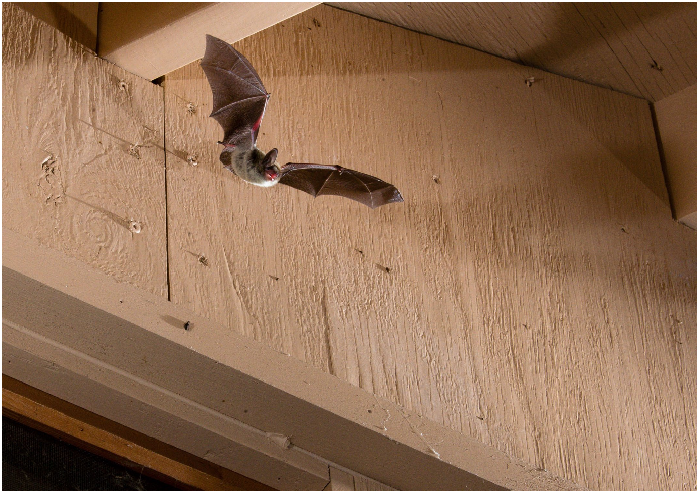
Figure 2. A Northern Long-eared Myotis ( Myotis septentrionalis ) photographed on 22 September 2014 emerging from the cabin roost shown in Figure 1. The bottom of the vertical opening where the bat exited the roost is adjacent to the beam above the bat.

min after sunset. On 14 September four bats were photographed leaving roost three, and on 22 September, seven bats were photographed at the entrance of roost three, but one bat appeared to be returning to the roost. On 8 October, we recorded two bats leaving roost three; the first bat left 35 min after sunset and the second bat left 43 min after sunset, but at least one bat was still in the roost after we finished recording. All openings used as exits to roosts were 1-1.2 cm wide vertical openings that were 15-17.5 cm long (Figure 2). The opening to roost one faced south and the openings to roosts two and three faced east.