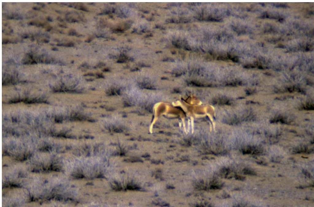
Fig. 2: Onagers grooming each other in Touran Protected Area.

We spent 5 days in November 1997 in the 600 km 2 of the reserve that is under complete protection from hunting, agricultural use and grazing. In both areas we observed onagers from a maximum distance 1.5 km, generally from the tops of hills and, when it was possible, we approached the groups to < 400 m in order to check the sex ratio and to age individuals using criteria from FEH et al. (1996). The DoE numbers are based on total count method: areas are divided into strictly defined areas in which all individuals are counted (walky-talkies communication avoids double counts). Concerning our data, numbers given thereafter indicate the sample on which we made observations but are not corresponding to a 'total count'.