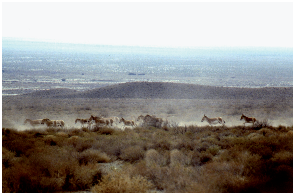
Fig. 3: Group of onagers in the Bahram-e-goor Reserve (photo: D. TATIN, 1997).

In November 1997, the group size of the BGR population ranged from 2 to 74 individuals (mean = 18.87; median = 9) and in March 2000 from 2 to 22 individuals in TPA (mean = 5.25; median = 4.5). Solitary individuals were observed in both populations. During his autumn-early winter survey in TPA, HARRINGTON (1977) observed a gathering of 162 individuals and wardens reported a second one totalling 550 individuals.