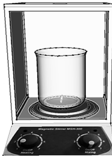
Figure 1. Experimental equipment scheme for molecular adsorption. 1: Cylindrical glass vessel PYREX®, 2: Magnetic stirrer, 3: Dark chamber.

The experimental test were done to ten values of initial concentration of the substrate (30, 50, 70, 90, 110, 130, 150, 180, 250, 300 mg/L) at pH 4, charge of catalyst of 0.1, 0.35, 0.5 and 1.0 g/L,