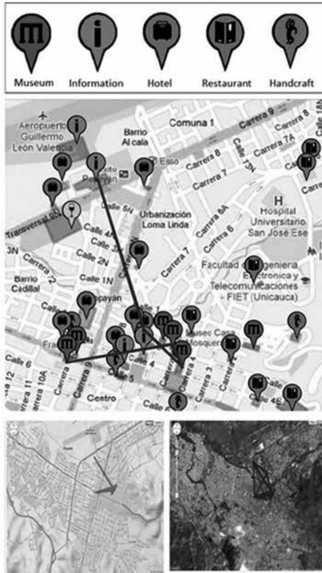
Figure 3. Maps about the tourist trace

MCS (model construction of solutions) Serrano (2005) which is a landmark in development of projects of RUP (rational unified process). Kruchten (2000), which generates three intermediate models that support the proposed model engineering: MER (model establishment of responsibilities), MDS