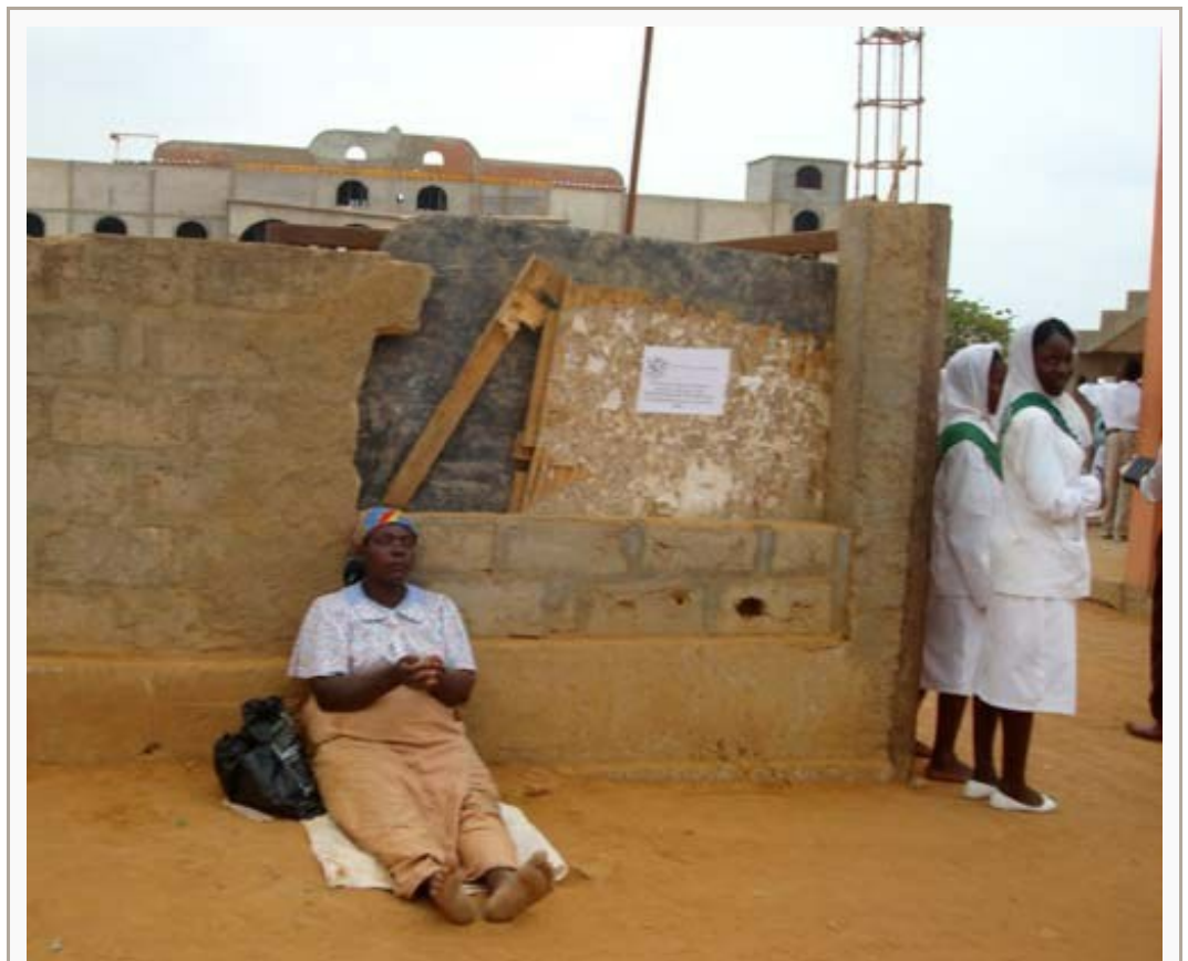
Tokoist believer praying at the door of Tokoist temple in Luanda, October 2008.