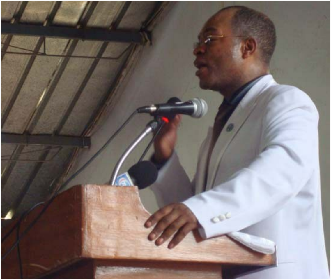
Bishop Afonso Nunes preaching in Luanda, April 2011.

However striking this repositioning may seem, it is a reflection of the Angolan post-war social and political scene, where ideas and debates on reconstruction, progress and hope have become pervasive, crossing boundaries between religious and political spheres.