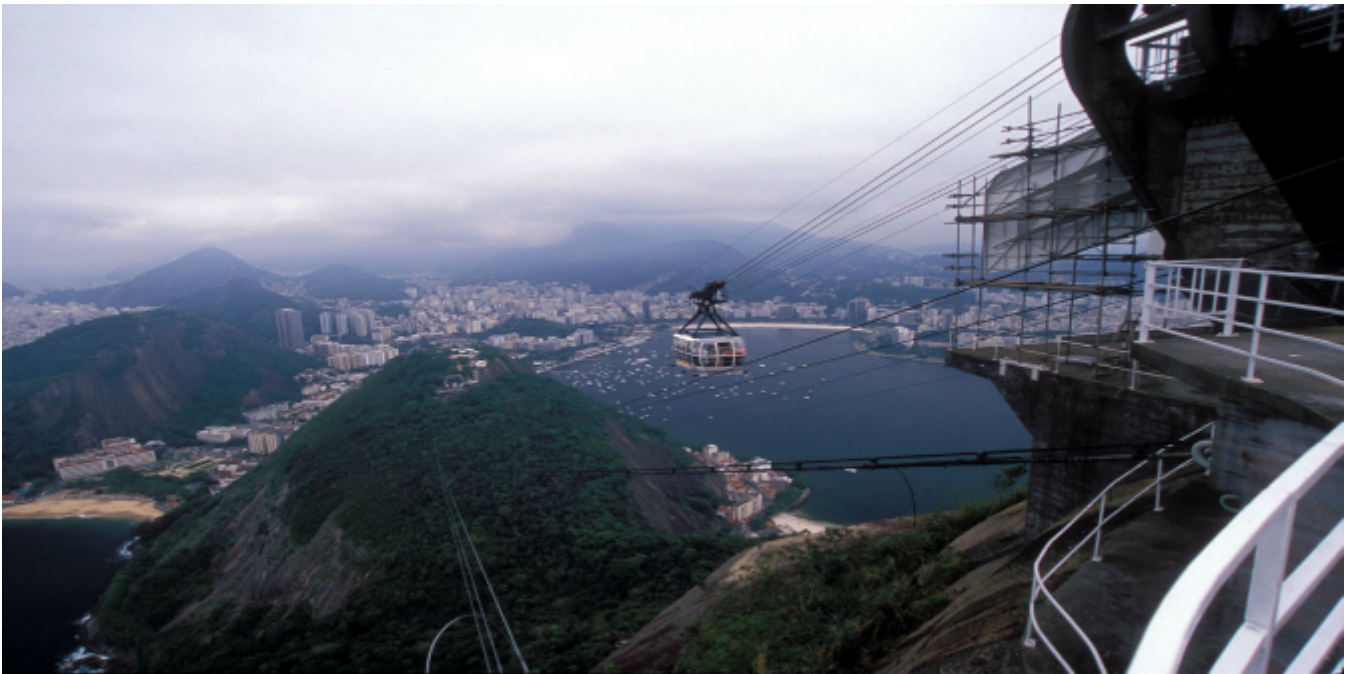
Sugar Loaf Cable Car – Bondinho Pão de Açúcar

International security poses a distinct set of challenges for an emerging power to become a 'rule maker'. For Brazil, these are complicated by the foreign ministry's unwillingness to brandish the swords of coercive diplomacy to shape the global order. Brazilian diplomacy requires national economic and social development that inspires others, while also generating the resources necessary for upgrading 'hard power' assets to deepen the country's role in collective security initiatives. Mares and Trinkunas argue that the exercise of soft power is contingent on military force capabilities, but Brazil has not yet achieved a level of economic and military power that could serve as the basis of expanding its contributions to the international security domain without 'eroding domestic support for its policy of "grandeza" [realising the enormous potential for development given the country's remarkable natural resources] by assuming excessive costs or undermining its claims to speak for the abused South in the international order' (106).