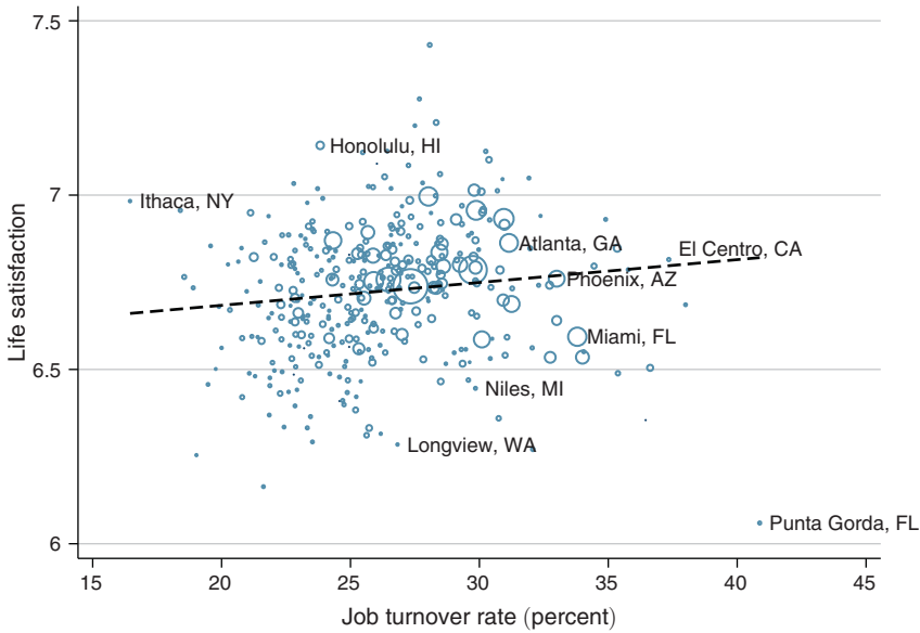
FIGURE 3. SIMPLE SCATTER PLOT