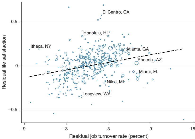
FIGURE 4. RESIDUAL SCATTER PLOT

MSA-Level Results. —Before displaying the regression results, we show two scatter plots where one observation corresponds to an MSA. Figure 3 plots the MSA's average life satisfaction on MSA-level job turnover, where circle sizes are proportional to MSA population levels. We then regress these MSA-level life satisfaction and job turnover variables on the MSA's unemployment rate and plot the residuals in Figure 4. We see that well-being is more strongly positively associated with job turnover, once we control for the unemployment rate.