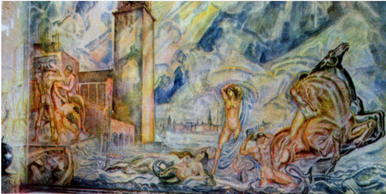
Detail of an expressionist mural by Axel Törneman depicting the building of Stockholm City Hall, 1925.

Some Swedish local authorities have embraced online services and forms of digital democracy. Others have been slow to take up the opportunity. Gustav Lidén rates the country's 290 municipalities according to the depth of their digital engagement, and looks at the possible factors influencing it. Lack of enthusiasm from senior politicians and bureaucratic inertia are key reasons why local councils are reluctant to invest in digital politics.