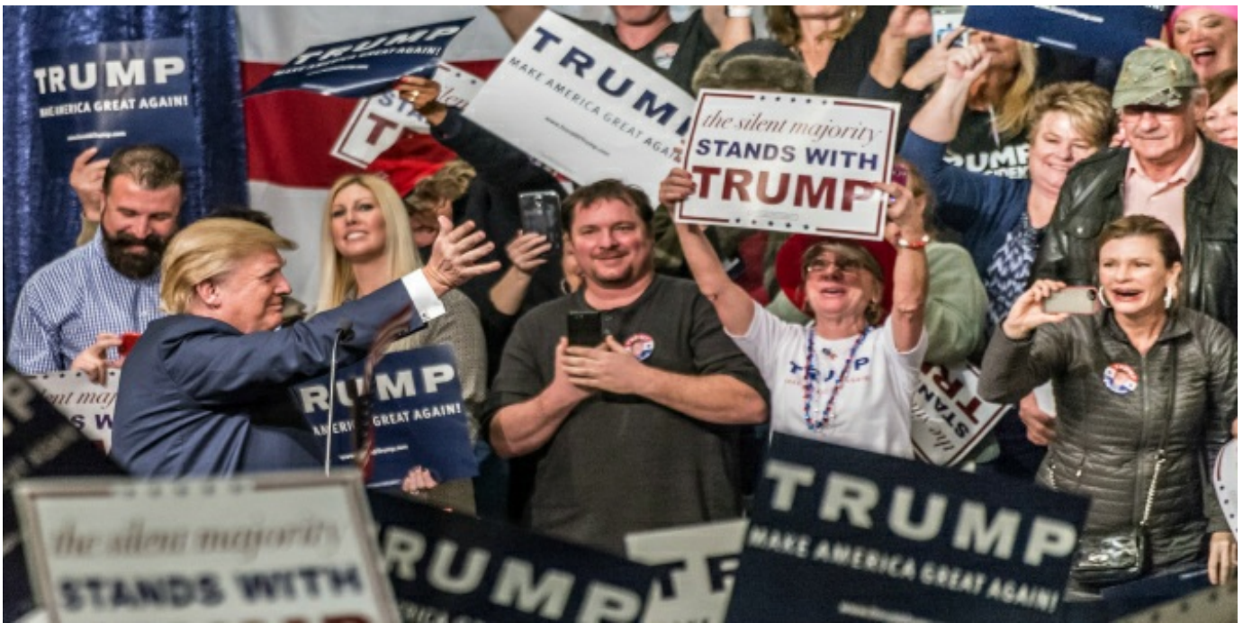
Donald Trump in Reno, Nevada, 10 January 2016

The last chapter addresses the pressing question of how to respond to populists. While much of the chapter is dedicated to explaining populism's appeal and criticising common responses to populism, Müller ultimately suggests that to engage with populists: 'One can take their political claims seriously without taking them at face value' (84). Thus, politicians and the media should address the issues raised by populists but challenge their framing. Regarding the US, he makes a case for addressing the doubts of citizens who call for cultural closure by alleviating their economic worries (91-93). Regarding Europe, he cautions that its political systems were built on a distrust of popular sovereignty, fuelled by the experience of fascism (93-96). Thus, scepticism towards the technocratic response to the Euro crisis is often conflated with populism. Müller criticises actors who condemn any critique of elites as populist as well as those who imagine a 'left populism' that is less exclusive. Instead of lamenting populists' disrespect for pluralism and inclusive political communities, we have to find more convincing arguments for both. Politically, rather than engaging in the construction of 'the people' as a whole, he suggests building partial majorities within political systems that bring in the excluded without marginalising the currently powerful (99).