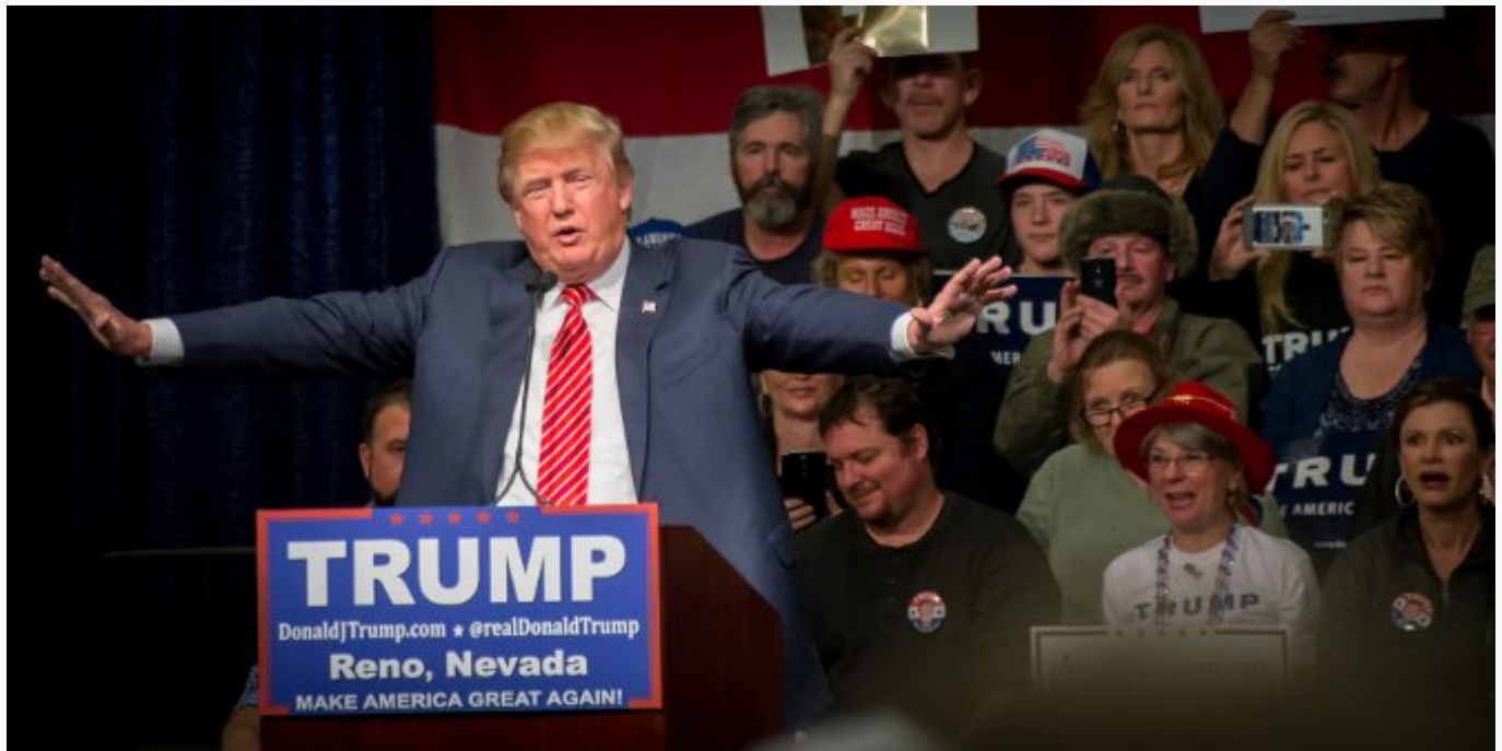
Donald Trump

At first, the circle of participants in American democracy was limited to just a select group of property-owning Anglo-Saxon men. Gradually, the franchise expanded to include more and more groups of people—poorer whites, women, people of color, and so forth. But membership of the political community has never been natural, obvious or uncontroversial; throughout US history, some people have been organized “in” to the republic’s political fabric and others organized “out.”