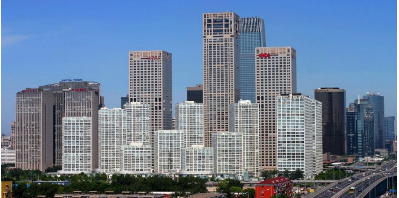
Beijing CBD – Jianwai SOHO, Yintai, WTC, Jinguang

Company managers may find the following practice useful: having these employees exchanged to experience working in headquarters in other countries or organising the brainstorm meeting in a different way.