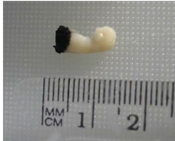
Figure 3: example of a biopsy-dart sample obtained via crossbow, showing epidermis (black tissue) and blubber (white tissue) of a sample obtained from a humpback whale.

Recently, a nascent but growing field of research has focused on measurement of lipophilic hormones, especially steroids, in blubber (Mansour et al. , 2002; Kellar et al. , 2006, 2009;