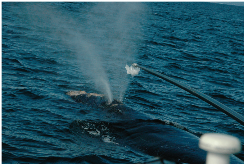
Figure 2: respiratory vapour samples ('blow') from large whales can be collected by a variety of pole-based or remote-controlled helicopter-based methods. This photograph shows collection of respiratory vapour (blow) droplets from a North Atlantic right whale ( Eubalaena glacialis ) using a nylon-fabric sampler suspended on the end of a carbon-fibre pole.

Several of the human breath-sampling methods described above have been successfully modified for cetaceans. Blow samples have been collected from small trained odontocetes in captivity by holding an inverted tube or other device directly over the animal's blowhole (Frere et al. , 2010; Thompson et al. , 2013). Blow droplets have been collected from both humpbacks and NARWs using a variety of sampling devices attached to long poles positioned over the blowholes. Pole-based samplers have included the following: nylon fabric suspended across a 15 cm ring or a plastic framework (NARW and humpback; Hogg et al. , 2009; Hunt et al. , 2012; Fig. 2), an inverted funnel (used with a stranded grey whale, Eschrichtius robustus ; C. Davis, unpublished data), and Petri dishes (killer whales, Schroeder et al. , 2009). A remote-controlled helicopter has been used to collect blow droplets on Petri dishes attached to the helicopter skids (humpback whales, Acevedo-Whitehouse et al. , 2010). Recently, a remote-controlled 'hexacopter'—a small, stable remote-controlled helicopter with six rotors—has been developed that shows potential for blow collection (W. Perryman, personal communication, NOAA SW Fisheries Science Center, La Jolla, CA, USA). Sample volume and