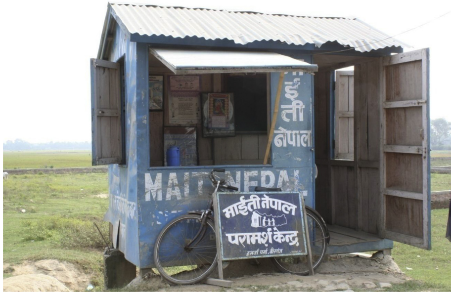
Fig. 1. NGO anti-trafficking kiosk at the Birgunj border. Photography by Diane Richardson, November 2011.

people. These policies have focussed in time and place on the points at which potential migration journeys are likely to start. Here the focus on preventing 'the coming in' is linked to efforts targeted at stopping 'the going out'. The co-produced trafficking border also expresses some elements of the links between those who seek to come in (come back) and those who wish to leave, as we now turn to explain.