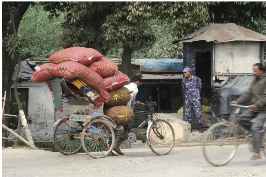
Fig. 2. Border guard 'spotting' those coming in and going out of Nepal.

The volume of trafficking and the speed at which rickshaws, in particular, sped past the gate while we were standing there raised serious doubts in our minds about the effectiveness of such measures. When we explored this further with the border guard, asking what criteria he used to 'spot' potential traffickers and their victims and whether he had received any training in this, he replied that he had only moved to this post from the goods processing office down the road, a few days previously. He stated that he would very much like to receive some formal training. When pushed further on the criteria looked for, he said that he tried to spot people who 'looked out of place' and who had physical features or an accent that