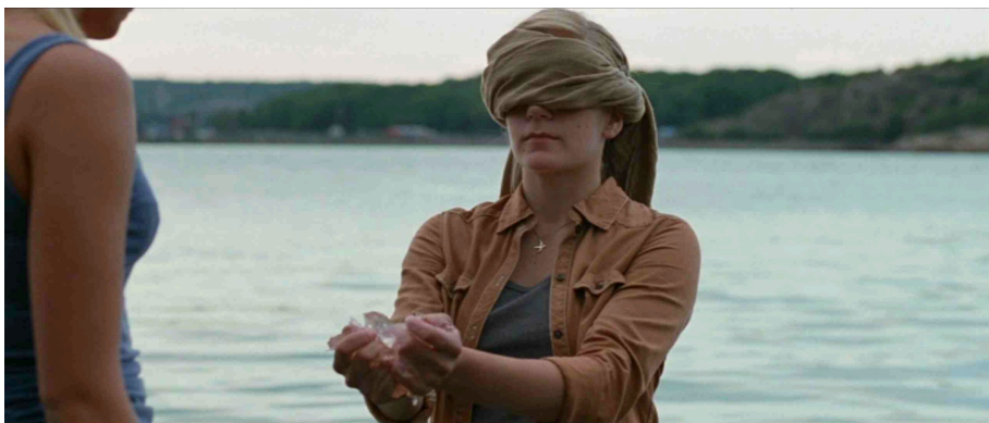
[Figure 11: blindfold.jpeg] She Monkeys – blindfold