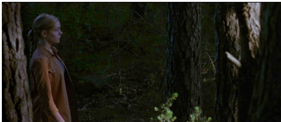
[Figure 1: Entry1.jpeg] She Monkeys - opening shot