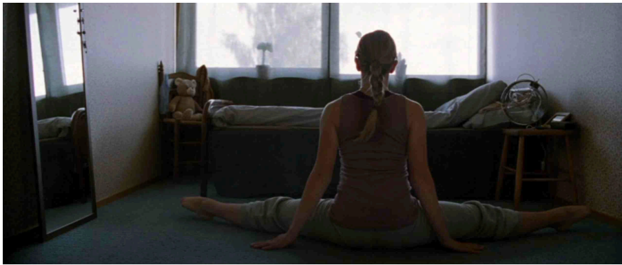
[Figure 3: fan.jpeg] She Monkeys – fan