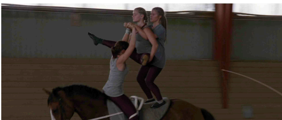
[Figure 6: stretching.jpeg] She Monkeys – stretching