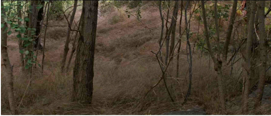
[Figure 14: rope.jpeg] She Monkeys – textural glue: dangling rope