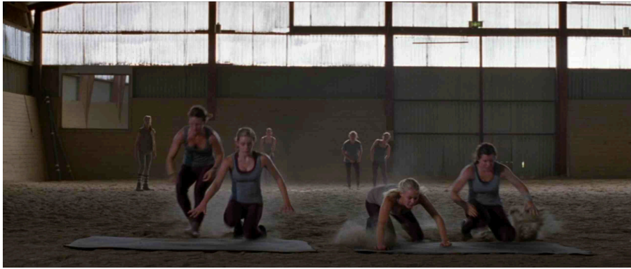
[Figure 8: feetandsand.jpeg] She Monkeys – feet and sand