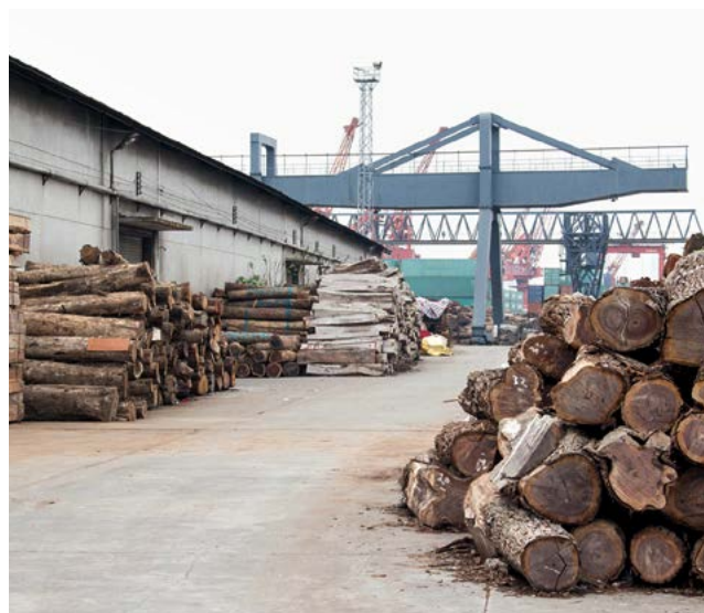
Stock of logs and sawnwood at Canton harbour (China)

After considering the definitions of illegality in timber importing countries, the next section addresses those of producing countries, including countries that have signed Voluntary Partnership Agreements (VPAs) with the European Union, and Brazil, the country with the largest forest area and illegal forest clearing estimated at between 68