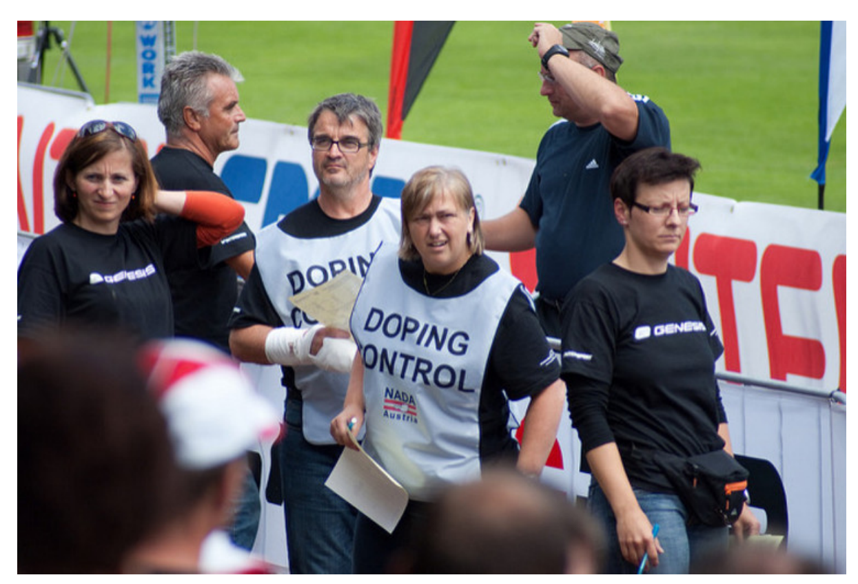
Testing times.

The second and opposing school of thought is that we should redefine clean sport and accept that performance enhancement is a part of sport. This includes arguments that all drugs should be allowed, and that genetic manipulation should be, too. A lighter version of the same position is that athletes can use drugs under medical supervision.