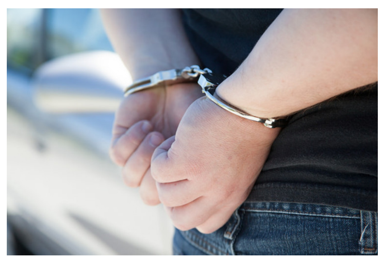
Harsh treatment.

Frankly, the debate is so polarised that it might be tempting to give up. But we need some some sense of rationality and perspective to map out a middle ground . This might emphasise integrity in sporting cultures, put the athlete at the centre of the policy process, and direct resources to the most important doping issues. Yet, there is no platform for this debate, and no mechanism for re-orienting the direction of travel WADA has pursued since it was formed. The only real solution is a multi-stakeholder, open and transparent debate that comes to conclusions that WADA is obliged to accept and deliver.