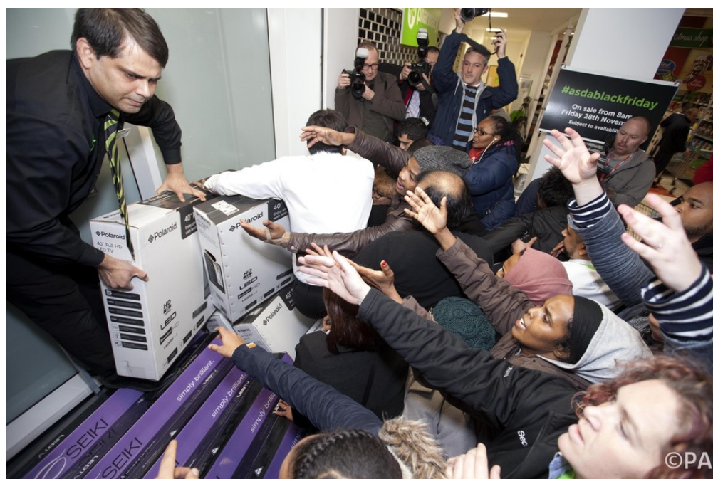
Scenes that retailers dream of.

Advent – the season of preparing for Christmas – has only just begun. But the build up to the consumption bonanza that Christmas has come to represent, started weeks ago. And to give retailers a December boost as they enter the holiday home straight, there's now Black Friday and Cyber Monday to get and keep us spending.