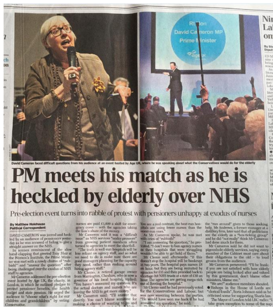
Matthew Holehouse, “PM Meets His Match as He is Heckled by Elderly Over NHS”, The Daily Telegraph , 25 March 2015, p. 13

The strapline ‘Pre-election event turns into rabble of protest with pensioners unhappy about exodus of nurses’ and headline together discursively construct older people as an homogenous group, connoting simultaneously that they are physically decrepit (‘elderly’), on low incomes and therefore needy (‘pensioners’) and irrational (‘rabble’) in their zealous challenge to the PM (‘jeering’ and ‘heckling’) to provide more NHS nurses. There are two photographs, one of an open-mouthed, wide-eyed, clearly impassioned older woman holding a mic asking a question and the other from the back of the room, so only the backs of people’s heads are visible, although a person holding up a walking stick is clearly a man (wearing a suit jacket). The front-facing woman is not named but in the