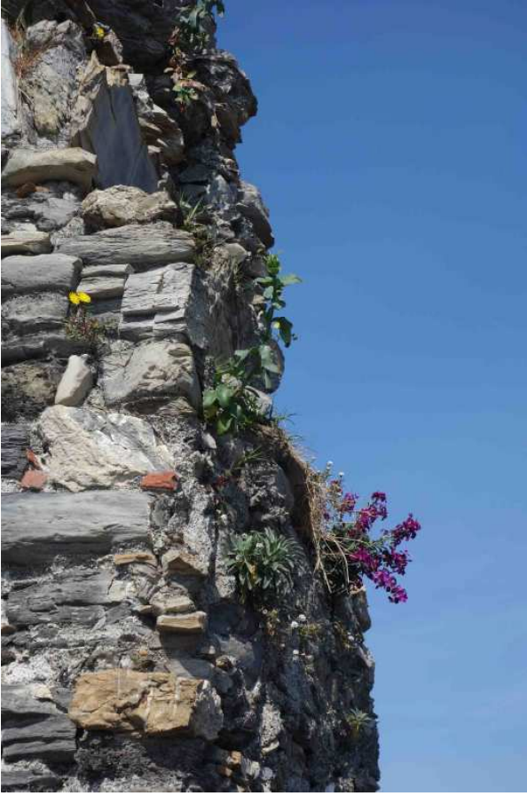
Figure 9 Matthiola incana L. (purple flower) and Lobularia maritima (L.) Desv. (white flower) on the West side walls of the promenade facing Genoa, below the Lanterna, June 2015 © R. Bruzzone.