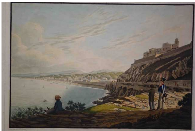
Figure 5 “Veduta del sobborgo di Sampiardarena al ponente della città di Genova presa dallo scoglio della Lanterna”, Luigi Garibbo (1812-14)