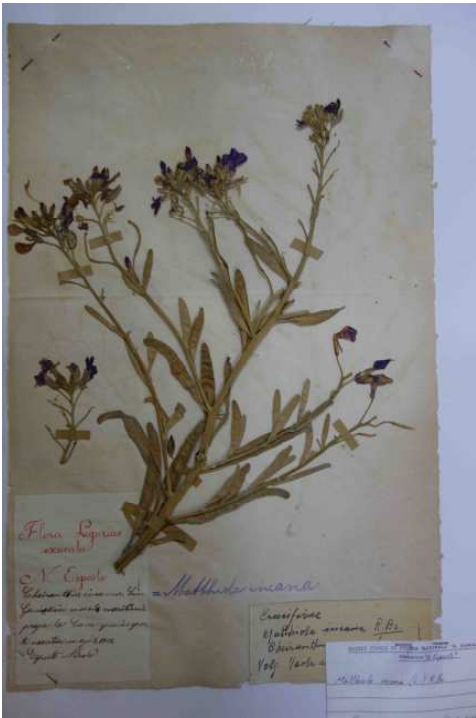
Figure. 8 Matthiola incana (L.) R. Br., 'Flora Liguria exsicata. N. Esposto. Cheiranthus incanus . Lin. Genuae in moeniis maritimis prope la Cava species sponte nascitur majo.9.1902. Esposto Nicolò' © Museo Civico di Storia Naturale "Giacomo Doria", Genoa.

Although most of the hillside and the surrounding semi-rural areas were removed during the twentieth century by quarrying and road and factory construction, there is still some vegetation immediately around the Lighthouse. In order to ascertain whether any of the species listed by Ray (1673) were still found on the rock we carried out five surveys between September 2014 and September 2015 at various times of the year and it was possible to identify nine species of plant on the rocks and walls that had been noted by Ray (Table 2) and an additional 28 species were also identified. 25 The survey was undertaken by following paths and access points on the Lighthouse rock which were all accessible to members of the public visiting the Lighthouse. A few areas were impossible to survey because they were dangerous to reach or covered by aggressive species like Ipomoea purpurea (L.) Roth and Rubus ulmifolius Schott (blackberry).