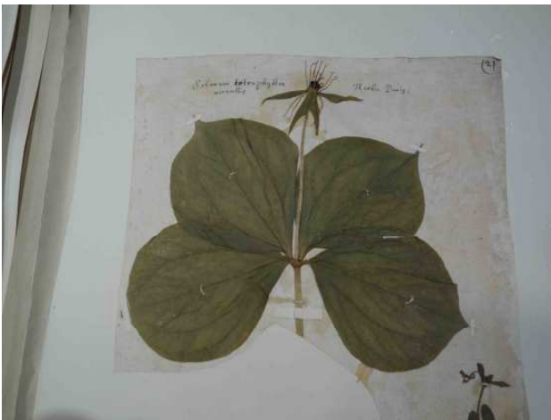
Figure 6 Herba Paris , Hortus Siccus Rayanus , Sloane Collection © Natural History Museum, London.

The identification of the plants they collected at Genoa is not a simple task. First we needed to establish what had happened to the collected plants. Unfortunately not all the specimens survive and most of those that do seem to be from Sicily, where they later spent two months collecting plants. 8 Much of their collection of dried specimens is now found within the pages of a copy of John Ray's Historia Plantarum printed in 1686/8 held at the University of Nottingham. This is in five volumes and dried plants are mounted next to the corresponding description. 9 The production and preservation of this collection has a complicated history and it is likely that it was undertaken by Francis Willughby's children Thomas and Cassandra. The specimens collected from Italy are mixed up with plants collected in many other places including some from the Botanical Garden in Padua. Some dried specimens collected in Europe are now part of Ray's herbarium in the Sloane Collection at the Natural History Museum (London), in nine volumes of loose sheets known as Hortus Siccus Rayanus . 10 These plant specimens are also mixed from British and European travels and are mainly labelled with Ray's handwriting but also Skippon's. The herbarium has been used and modified through time and many of the specimens have been cut out as we can see in the example of Herba Paris (Figure 6). 11