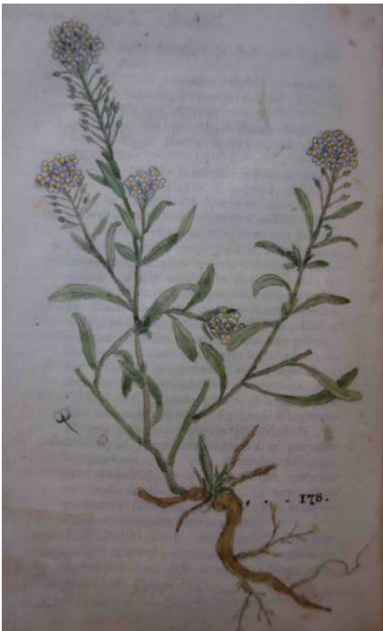
Figure. 7 178. Alyssum maritimum [...] In moeniis maritimis Genuae. Floret tota hyeme. Peren. alla Cava