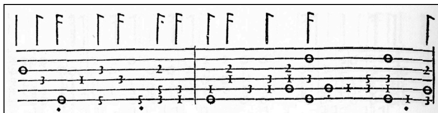
Figure 1. Excerpt of lute tablature in French style.