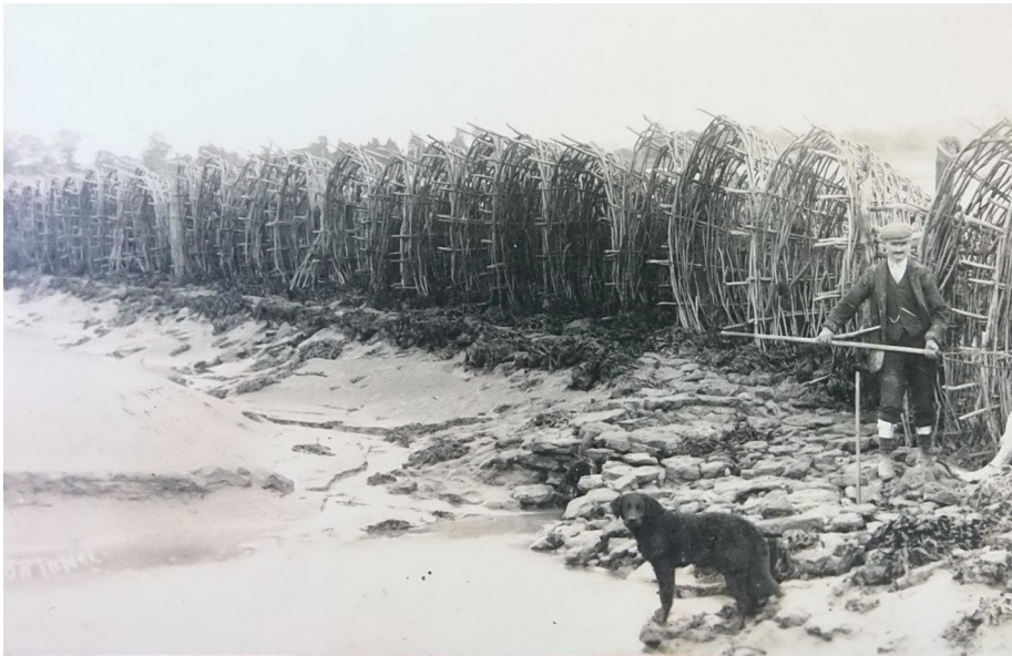
Figure 1: A salmon fisherman and his dog, by an “engine” of putts on the River Severn.