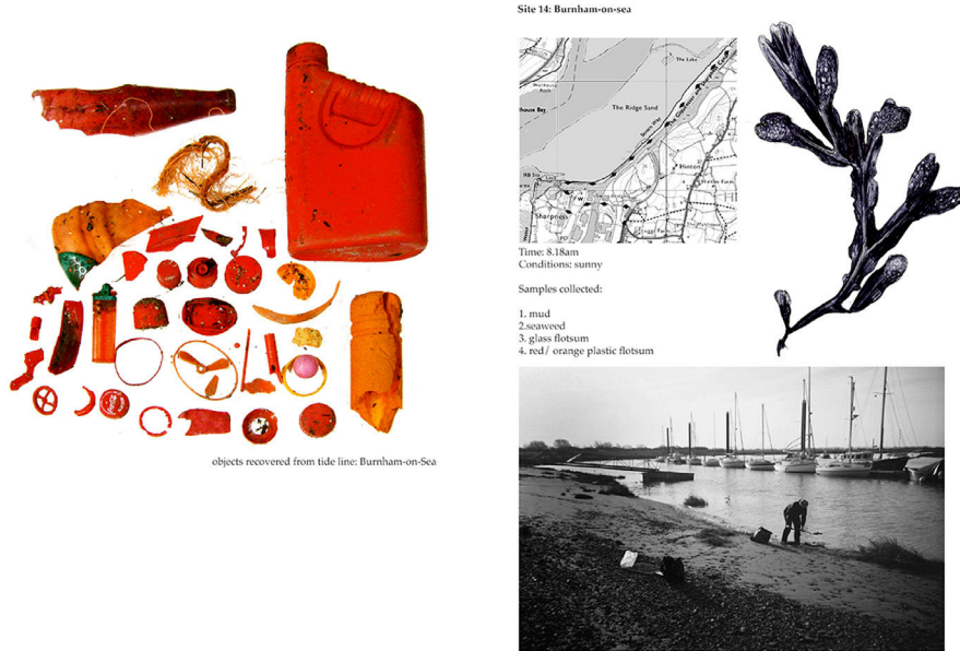
Figure 3: ©Tana West, Subject to Change: River Severn (2009), documentation. The research process is as important to West as the end product, and she documents it carefully. This shows a section of her Severn walk route, found objects (natural and man-made), and an image of her extracting mud from the riverbed.

With funding from the Arts and Humanities Research Council, I held a one-day workshop with West at Severn Beach that brought a diverse group of people together to establish a temporary ceramics manufacturing base. 9 Amateur potters, members of a local community group, and academics were taught how to form and shape the clay, which had been extracted from the estuary mud flats the day before. We pressed it into moulds, collectively dredged it with shaped frames to create a water “pipe,” and freestyled on our own using the materials around us. Sheltered in the lee of the seawall, we worked the clay as the tide receded in front of us, exposing more of the raw material. From the base, we could see the Severn Bridge that connects England and Wales, and the processing plants of Avonmouth. We talked about the river while we worked and our conversation drew in passers-by. The experience placed the river in the context of the lives of people who live by it. The energetic wind whipped around us the whole time, yet by the end we had crafted a range of objects from the mud of the river, and appreciated them, “stilled at the edge of the Severn’s turbulence / and the tangled waters of two river currents.” 10