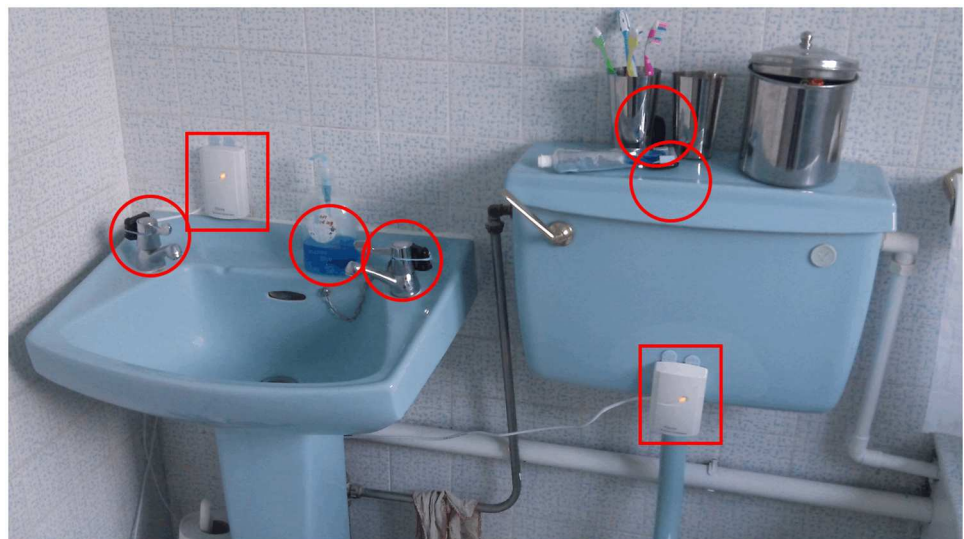
Fig 2. Elpas system in action.

Sensors from the three different sensitivity levels were selected to reflect the different expected motion patterns of the different objects. In order to avoid false positives, each object was affixed with the least sensitive sensor which reliably detects actual object usage. For example, toothbrush cup use would only effect a slight movement, toilet flush a slightly greater movement, and toothpaste an even greater movement. By attaching sensors to these objects, the following behaviours were measured: going to the toilet, washing hands with soap, brushing teeth, flossing, and vitamin taking. As the optimal settings for the system were still being determined for the first two households to be set up, adjustments were made to the sensors