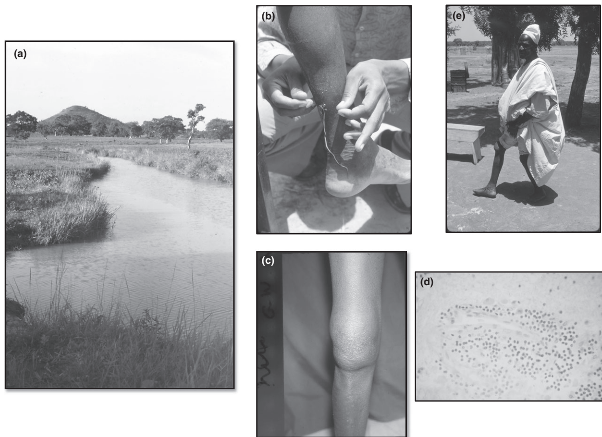
Figure 2 (a) Typical pool used for washing and as a source of drinking water during the farming season, (b) local extraction of a guinea worm using a twig, (c) arthritis of the knee in a patient with a guinea worm emerging above the medial malleolus, (d) synovial needle biopsy from the patient shown in panel c showing infiltration of the synovium with mononuclear cells, (e) long-standing damage to the knee and permanent disability following guinea worm arthritis of the knee.

anaerobically for 48 h. The predominant colony was characterised by morphology and by Gram stain and the species identified using conventional microbiological techniques. Antibiotic sensitivity against penicillin, streptomycin, chloramphenicol, tetracycline and neomycin was determined using a disc method.