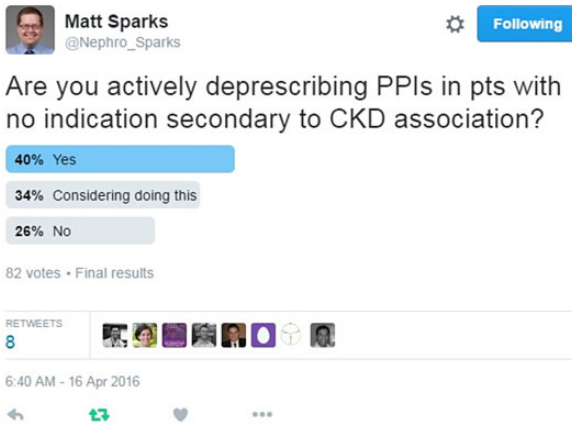
FIGURE 1: The relationship between PPIs and CKD has caused much discussion on social media [6] (colour image available online).

The gold-standard way of determining drug efficacy and adverse effects is the randomized clinical trial. Fundamentally this is because, if adequately powered and with a successful allocation procedure, randomization ensures that there is a balance of both measured and unmeasured confounders between the study arms. Similarly, comparison of effects between drugs, or between treatment and none, is also commonly assessed in