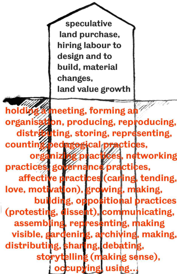
Fig. 2: Illustration of practices of participation as the hidden supports of building as capitalist accumulation. Illustration: author.