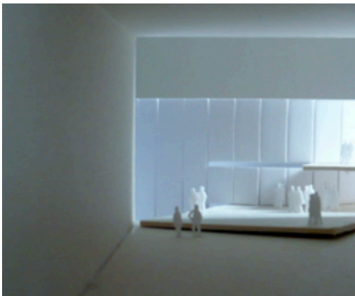
Fig. 7 My Newsfeed, internal view 2010