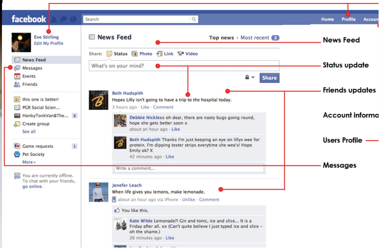
Fig. 6 My Facebook Newsfeed 2010