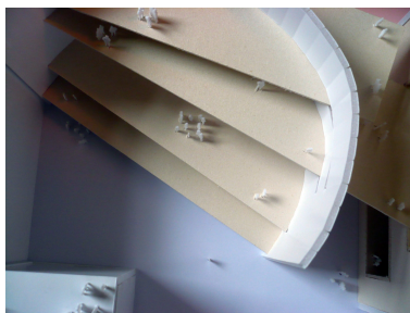
Fig. 3 My Wall Architectural Model

Wall, is open and yet closed from the Newsfeed. The curved Wall on the model (see fig.3) has four staggered steps running across and up it and these represent the layers of conversation which took place on my Facebook Wall (fig.4) The layered nature of the steps illustrates the manner in which the differing conversations may be viewed by other Facebook Friends – some conversations can be observed, some can be interacted with and others cannot be seen at all. Some of the conversations are open for others to see and some are more private (see fig.3). There is a linked walkway to link some parts of the Wall to the Newsfeed, which is the main central structure of the model. This represents the backwards and forwards relationship between posting on my Wall and it appearing on my Newsfeed.