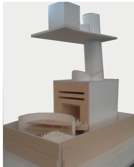
Fig. 2 A Site of Possibility: Facebook an Auto-Ethnography. An Architectural Metaphor. Scale: NTS

This section details the process of architectural model making as a research method using my auto-ethnographic model (fig.2), which I produced mid-study, as an example. The model is entitled ‘A Site of Possibility: Facebook an Auto-Ethnography. An Architectural Metaphor’, the model is part art-work and part analytical sketching. The model was produced to exhibit at The Centre for the Study of New Literacies 2010 Conference, University of Sheffield, UK - Materialising Research .