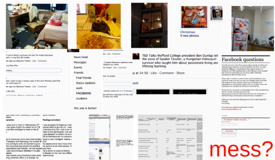
Fig. 1 Field data – messy realities of social research

As a result of the year-log ethnography, the data collected during my time spent in the field were: fieldnotes, scratch notes, critical incidence screen shots, interview transcripts, photographs and videos (a selection shown see fig. 1). These were all part of the bricolage that formed the basis for my modelmaking practice.