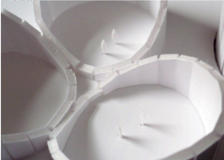
Fig. 8 My Chat Architectural Model 2010

Chat, is a private space between two people, one of whom is me. In the model only three Chats are represented (see fig. 8) as, in 2010 in my Facebook use I rarely chatted to more than three people at a time on Chat (see fig.9). The sloping sides represent that I am able to see the other Friends I chat to but that they cannot see each other. The Chat section is high above the rest of the model (see fig. 2) as Chat takes place as a layer over the top of the rest of the Facebook practices.