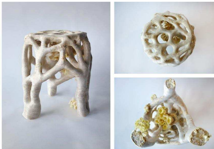
Fig. 1. Veiled Lady by Studio Eric Klarenbeek © Studio Eric Klarenbeek 2014

Projects like Veiled Lady by Studio Eric Klarenbeek and Silk Pavillion by the MIT Media Lab are examples of how objects can evolve from an embryonic stage into complex unique artifacts if they are nurtured and understood, and can reinforce the relationship between users and their things. Veiled Lady is part of the The Mycelium Project - Print and Grow . Using a 3D printer with two independent extrusion nozzles, an inoculated straw based substrate was deposited inside bioplastic structures printed at the same time with the configuration of a bench and, after a few weeks it bloomed. The growth process was interrupted by dehydrating the mycelia resulting in a stable unique product (Klarenbeek, 2014).