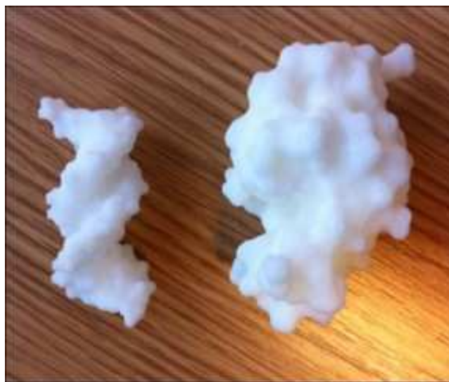
Figure 1. 3D printed models. B-form DNA (left) and the enzyme lysozyme PDB: 2LYZ (right) used within the teaching session.

In the DNA sessions the main learning outcome was to understand the difference between the major and minor groove within the structure of DNA and how proteins interact with these conformations.