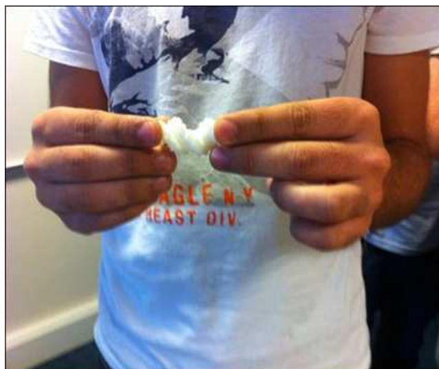
Figure 3. Photograph. Students handle the 3D printed molecules and were asked to identify structural features.

In order to develop a 3D understanding of biological molecules students were asked to handle printed models and apply their new knowledge and concepts through self-directed small group discussions (Figure 3). Twenty molecular models were handed around the group of 150 students in a standard lecture theatre, with