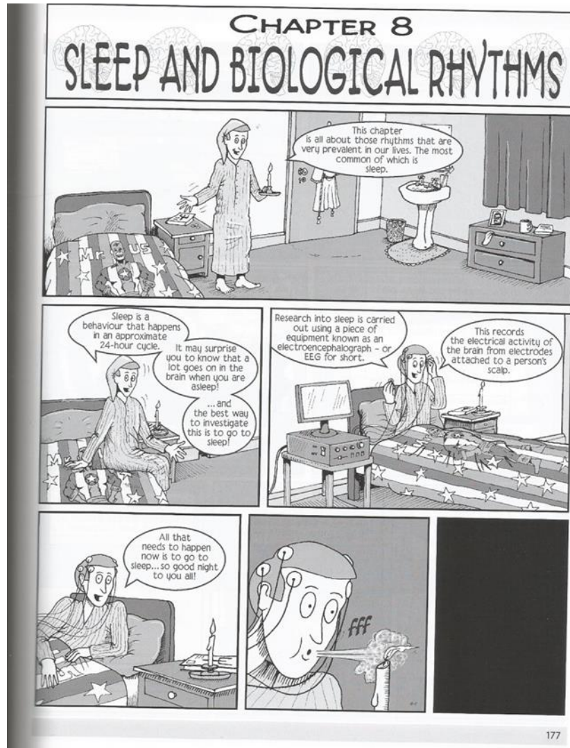
Figure 2 Condition 2 - Example of Comic book (page 1)