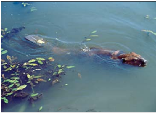
Beaver tagged and swimming.