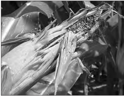
Corn damaged by birds.

landscapes providing more forest edge, the size of forest patches might also play a key role in determining species distribution and abundance. Larger and more complex forest patches might be more favorable to wildlife species than smaller and less complex patches.