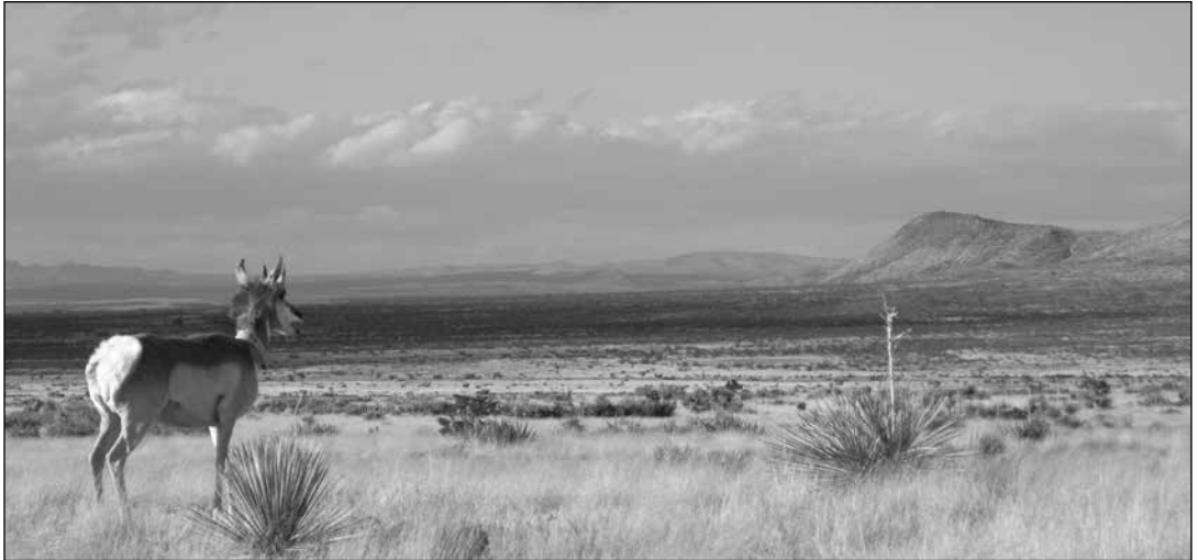
Figure 2. A pronghorn stands on the valley floor of the Corona Range and Livestock Research Center, New Mexico.

village of Corona, New Mexico, the CRLRC has an average elevation of 1,900 m; mean annual precipitation across the facility is 40 cm, most of which occurs in July and August as high-intensity, short-duration convective thunderstorms. Topography consisted of valley floors (0 to 5% slope), gently sloping uplands (2 to 15% slope), steep (30 to 75% slope) mesa sides, and rock outcrops (Figure 2). Vegetation is composed of perennial grassland with an overstory of sparse to dense pinyon pine ( Pinus edulis ) and 1-seed juniper ( Juniperus monosperma ) woodlands. Predominant grasses are blue grama ( Bouteloua gracilis ), wolftail ( Lycurus phleoides ), threeawns ( Aristida spp.), sideoats grama ( Bouteloua curtipendula ), and sand dropseed ( Sporobolus cryptandrus ).