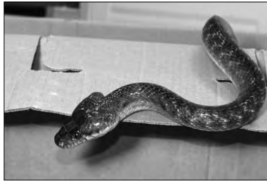
Figure 1. Brown treesnake exiting a cardboard box.

Many household goods shipments from Guam enter continental United States through 1 military port in Long Beach, California. We, therefore, hypothesized that areas in the southern coastal United States receive more shipments from Guam than from other locations. However, many vessels leaving Guam carry sealed containers going to multiple final destinations. The shipments