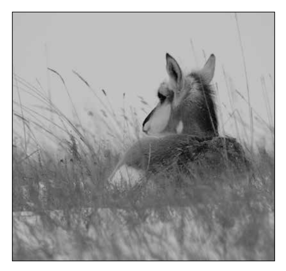
Figure 3 . A female pronghorn near Medicine Hat, Alberta, showing hair loss on her hind quarters as a result of crossing under barbed wire fences.

hair in pronghorn occurs year-round, further exacerbating the negative effects. The loss of hair and its potential negative ramifications is likely more pronounced for pronghorns inhabiting the northern portion of their range in North America due to the severe winter temperatures that are common for this geographical area. Further, effort is required to quantify the extent of hair loss in pronghorn across their range and assess the short- and long-term negative effects.