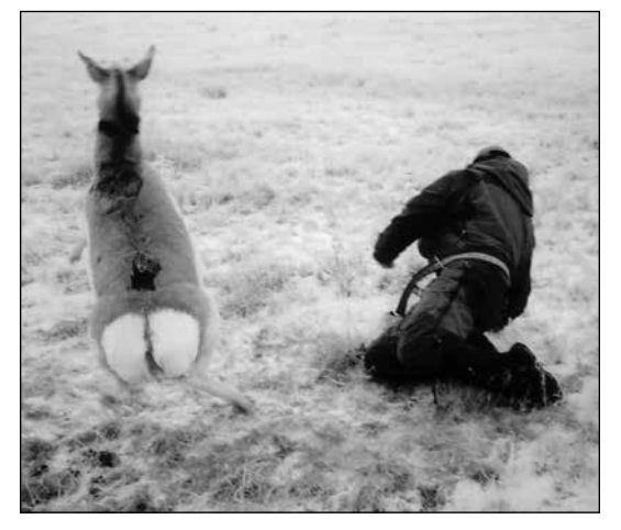
Figure 2. A female pronghorn captured in southern Alberta, Canada, shows significant hair loss (dark areas) along her neck, back, and rump. Notice how the areas with hair loss have turned black, particularly on her hind quarters.