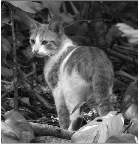
Figure 1. Feral cats pose a threat to wildlife the world over.

associated with a management alternative. Therefore, the results of opinion polls have limited value because the public is generally uninformed of the costs and benefits associated with a wildlife management technique.