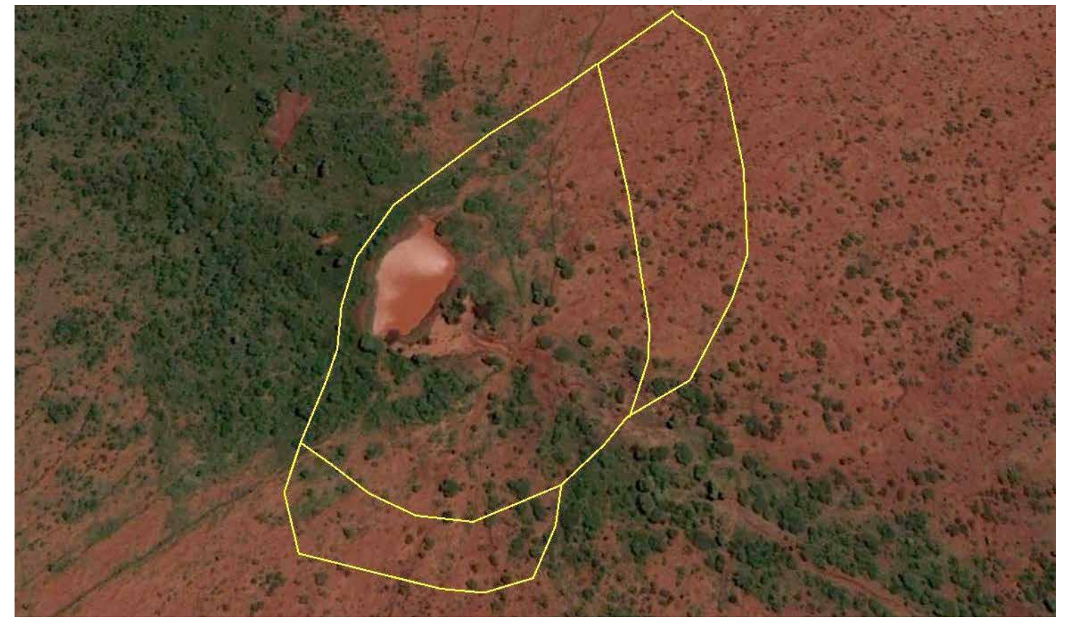
A Google Earth image showing the original fence outline at Dikale and the two extensions to the enclosure. Note the main gully running into the pond from the south-east, and a pair of secondary gullies that flow north, converge and join the main gully close to the pond. The main gully runs straight into the pond from a catchment of 0.5 km<sup>2</sup> and is the principal source of both water and sediment. (Image compiled by Brien E. Norton)

This is not a surprising result. No attempt was made to manage the head of the Dikale main gully system nor to control water flowing down its long straight length. Landscape ecologists from southern Africa, now working in Australia, emphasize the importance of