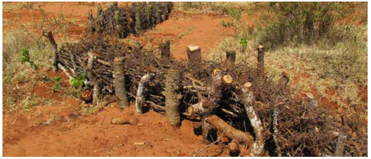
A pair of sieve structures at the confluence of 2 secondary gullies in the Dikale enclosure. The basic design consists of two rows of tree stubs sunk into the gully floor and packed with acacia branches. Some excavation has occurred in sand at the base of the sieve near the camera due to animal activity.

There are two essential components to managing the erosion problem: rehabilitating the landscape to control the source of soil loss, and reducing sediment flow through the gully system. Our project addressed both of these components. Another report describes the benefit of protection from livestock to foster revegetation of degraded landscapes that will hold soil in place and enhance rainfall infiltration. This report describes strategies and mechanisms to heal gullies and restrain sediment movement into ponds.