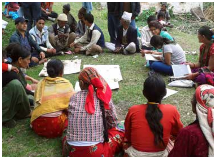
PRA session.

3. Lack of off-farm income sources. There are very few sources of cash income for farming households across all four of the communities, and people's income-generating skills are also limited. Local opportunities are needed to generate off-farm income to reduce the need for younger family members to go abroad under risky circumstances to find work. This problem is related to the inability of most farms to provide enough food for their household members. This, in turn, is due to small acreages with respect to a growing human population. Lack of local markets also plays a