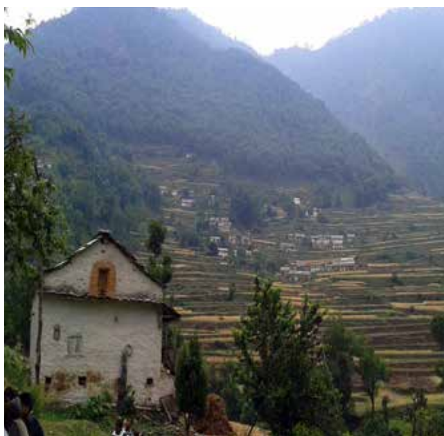
Terraced hillside with village.

Such objectives appear simple, but small-farm systems are complicated. The residents are typically affected by poverty, population pressure, and lack of development investment, so climate change must be considered in combination with other problems of daily life.