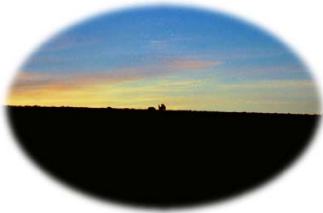
Figure 4. Male sage-grouse strutting at sunrise.

priority areas. Most of these plans rely on annual spring counts of males attending leks to estimate population trends. Leks are the center of breeding activity for sage-grouse and provide managers with a way to monitor population trends (Fig 4). For example, the Utah Sage-grouse Conservation Plan proposes to sustain an average male lek count at 4100 males and increase the population of males to 5000 within the established SGMAs (both numbers are based on the ten-year rolling average on a minimum of 200 monitored leks).