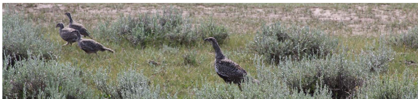
Figure 1. Sage-grouse brood in late summer.

In the 2015 decision, the FWS reemphasized the need to focus conservation efforts on protecting and enhancing priority habitats for species conservation. Many sage-grouse conservation plans have established either population or habitat management objectives within priority conservation areas. For management objectives to be valid, they must be realistic and achievable. In other words, managers must have some degree of control of the factors which most influence outcomes. If factors that influence objectives are outside the control of the manager or not within the natural variability of the systems being managed, failure and frustration is inevitable. Management objectives should also be based on the best available science and information. Thus, an understanding of sage-grouse population dynamics and how they relate to habitat characteristics (e.g., vegetation cover, scale, and fragmentation) and other environmental factors is paramount to setting effective management objectives. For example, setting objectives for the