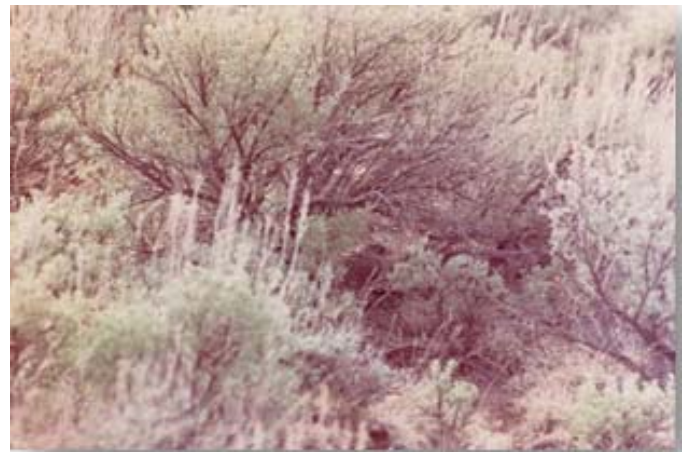
Figure 3. Female sage-grouse on a nest.

Sage-grouse nest success tends to fluctuate across populations and by year within a population (Fig. 3). Nest success in the same area can be higher in a year with more precipitation and better cover than