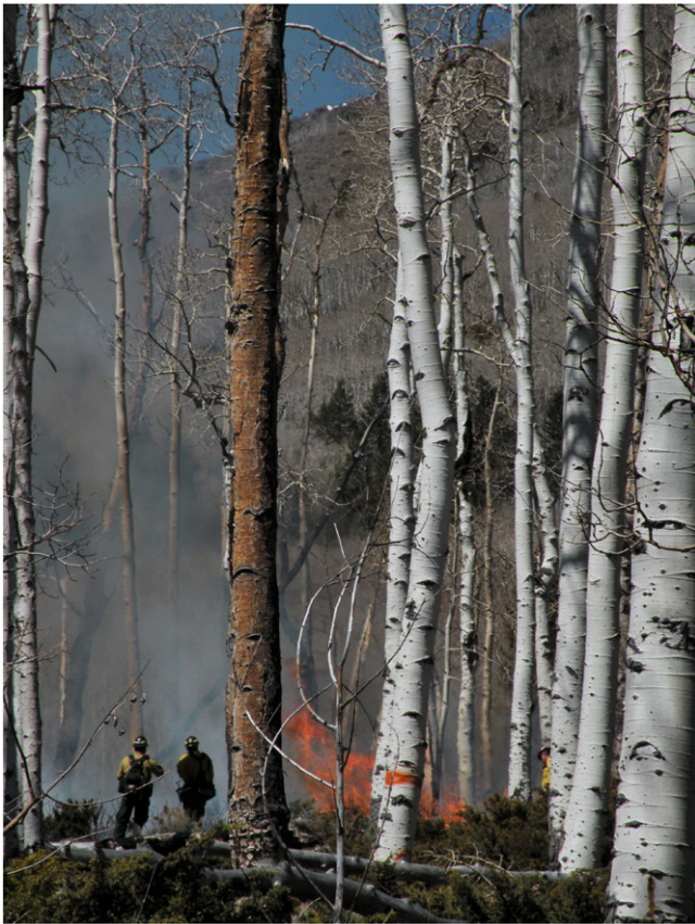
Figure 2. Prescribed burning at the Pando clone, near Fish Lake, Utah, was part of an experimental treatment regime to test regeneration response, fencing, and monitoring methods. Recent mortality of mature trees combined with long-term herbivory patterns has posed a threatening situation to the survival of this iconic aspen clone, currently thought to be the largest living organism on earth.

state and federal agencies, quickly reversed these positive trends and persisted through most of the next 100 years. There is debate if fire suppression had widespread impacts on aspen communities, as the 20 th century was unusually wet climatically, and much of this time suppression techniques were variably effective depending on forest types and firefighter accessibility. 9,10 Regardless of cause, many seral aspen communities witnessed a decline over this period as conifer succession advanced. Stable communities were largely unaffected due to their limited flammability. 10 Because seral aspens are more common in Utah, an overall reduction of aspen cover likely resulted. 11 This trend might be expected to reverse as warming temperatures are predicted to increase wildfire, which favors aspen renewal at some locations, while associated drought may limit aspen habitat at vulnerable low elevation sites. 12