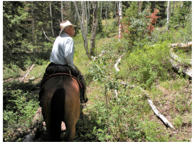
Figure 3. A horseman surveys an area on Monroe Mountain, central Utah, where cattle grazing has been absent for several decades. In this case, adequate recruitment is occurring (note tall regeneration at riders chest level) in seral aspen; uphill, where slope angles are lower and stable aspen dominate, elk browsing has nearly eliminated regeneration. Costs associated with intensive surveys, as well as temporary limits on domestic and wild ungulate use, are among the difficult tradeoffs being considered to ensure sustainable aspen resources.

Quaking aspen stands are widely revered by range and wildlife managers alike for their high productivity and nutrition of the understory forage. Young aspen suckers are utilized as forage by deer, elk, cattle, and sheep. Late in the growing season aspen are a particularly important forage source for ungulates. 13 Fortunately,