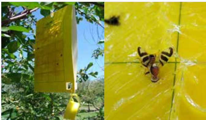
Fig. 9. A yellow rectangular sticky trap with additional ammonium carbonate bait attached at the bottom of the trap (left) is effective for monitoring walnut husk fly adults; close-up of adult walnut husk fly caught on a trap.

Maintain and check traps one to two times per week throughout husk fly flight. Record the number of walnut husk flies and remove all insects and debris to keep adhesive surfaces clear. Replace traps and refill or replace ammonia baits at least once per month.