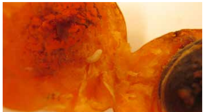
Fig. 4. Walnut husk fly larva tunneling in ripe apricot fruit.

Walnut husk fly (Order Diptera, Family Tephritidae; Fig. 1) is the most common insect pest of walnuts in Utah. Husk fly larvae (maggots) tunnel in walnut husks, causing them to soften and decay, and stain the shell (Fig. 2). Damaged husks are difficult to remove. If husk fly infestation occurs early in kernel development, nuts may shrivel, darken, become moldy, and drop from the tree (Fig. 3). For commercial producers, discolored shells result in reduced quality for in-shell sales, and nut loss lowers profits. For home gardeners, difficult removal of softened husks is the primary problem. The husk fly also infests ripe apricot and peach fruits, usually only when infested walnuts are nearby. The larvae chew tunnels in fruits causing reduced quality and decay of the flesh (Fig. 4).