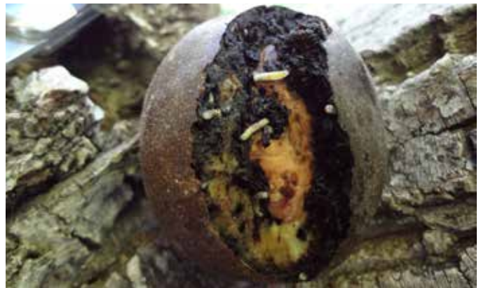
Fig. 2. Walnut husk fly larvae feeding in walnut husk. Decayed husks are difficult to remove and cause nut-shell staining.