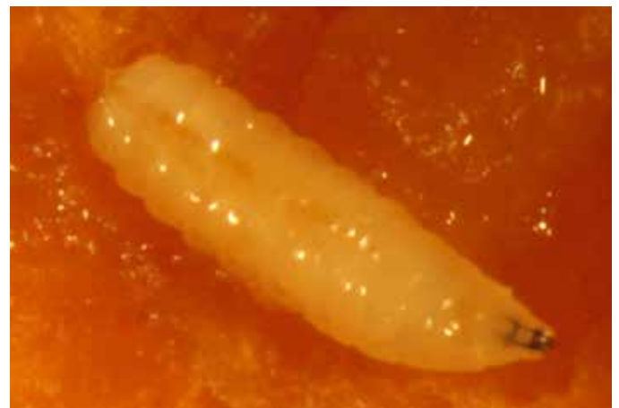
Fig. 7. Close-up of walnut husk fly larva. Note the tapered head with two black mouth hooks.