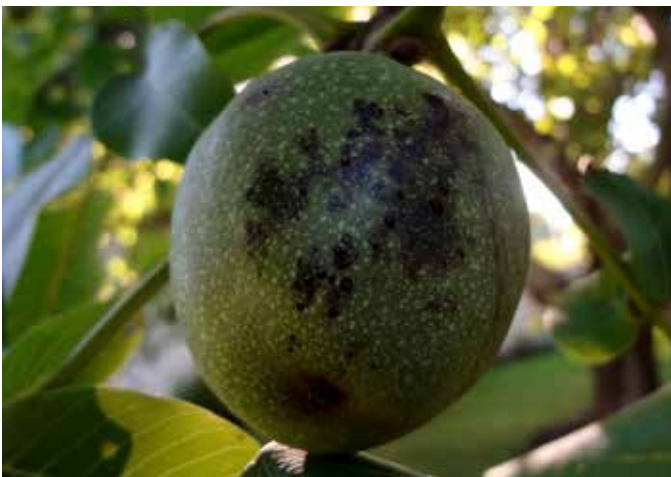
Fig. 8. Egg-laying punctures cause "stings" or dark spots on walnut husks.

The walnut husk fly is primarily a mid- to late-season pest (August and September). Early-maturing English walnut cultivars may escape injury. Egg-laying punctures cause dark spots on the husk (Fig. 8). Larvae feed inside walnut husks, turning them soft and black. Soft parts of the husk will decay and stain the nutshell (Fig. 2). Damaged husks are difficult to remove and nut-shell stain will decrease the retail value of unshelled nuts. Husk fly infestation of walnuts in July to early-August may cause shriveled and moldy kernels (Fig. 3) which often abort from the tree. For peach and apricot, typically only later-maturing cultivars are attacked. The pinprick egg-laying punctures are barely visible; however, larvae tunneling within the flesh reduce fruit quality and may make fruit inedible (Fig. 4).