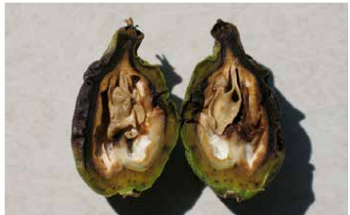
Fig. 3. Shriveled walnut kernel caused by husk fly injury occurring in July to early August.