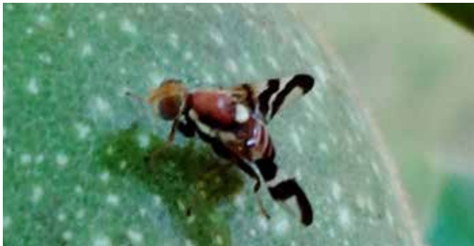
Fig. 1. Walnut husk fly adult on walnut husk. Note the inverted V-shaped banding pattern on the wing tips.