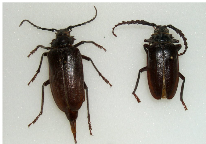
Fig. 1. Adult prionus root borer, female (left) with ovipositor extended, and male (right) with larger antennae for detecting female sex pheromone.

The adult California prionus is a large beetle, ranging in size from 1¾ - 2¼ inches long (45-60 mm). Adults are reddish-brown in color, relatively smooth and shiny with long, deeply notched antennae (Fig. 1). The larvae can be as long as 4¼ inches (108 mm) with a diameter of approximately ¾ inch (18 mm) at the widest point of its body (Fig. 2).