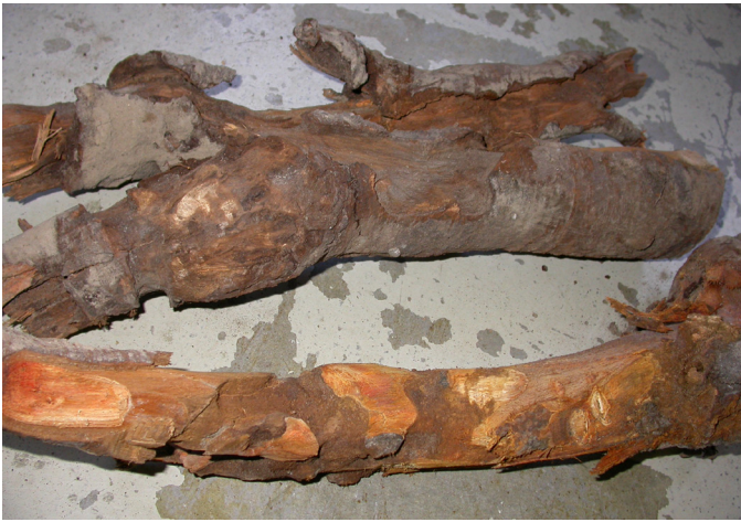
Fig. 3. Furrows in sweet cherry roots made by prionus larvae.

Larvae will chew deep furrows in the roots (Fig. 3), often causing severe reduction in a tree's ability to take up water and nutrients. The feeding injury is often associated with rot and decay, particularly in wet soils. The colonization of feeding wounds by soil microbes will compound the damage caused by larval tunneling. Larvae feeding in the crown form spiraling furrows which girdle the crown and upper roots (Fig. 4).