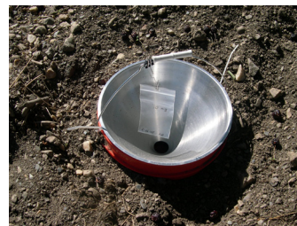
Fig. 5A. Bucket trap with experimental prionus pheromone lure.

Adult prionus can be monitored using pheromone and light traps. The Prionus californicus sex pheromone has been identified and found to be highly attractive to male beetles. Studies in northern Utah have found that hanging the pheromone lure over a funnel placed in a buried bucket can be an attractive trap to the male beetles (Fig. 5 A and B). In a sweet cherry orchard in 2009, males were captured in traps during July and August; more males were caught in bucket than panel traps, and more were caught in pheromone-bated (Phero) than non-baited (Untrt) traps (Fig. 6.) In 2010, males were caught in pheromone-bated traps from July through September. A commercial pheromone lure is expected to be available soon. If pheromone traps are attractive enough, they may be successful in reducing the local Prionus californicus population (i.e., mass trapping). The beetles typically fly soon after sunset, and they are attracted to lights. Trap-catch may decline after midnight, presumably due to colder temperatures. Adults begin to emerge in early July in northern Utah, and probably 2-4 weeks earlier in southern Utah.