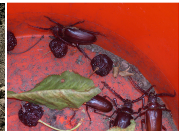
Fig. 5B. Prionus males caught in bucket trap.