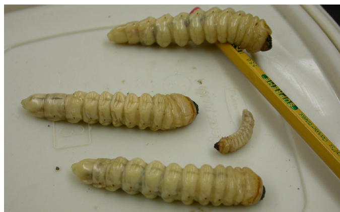
Fig. 2. Prionus larvae of various ages, ¾ - 4¼ inches long.

Adults emerge from pupae in the soil in July in northern Utah. The beetles fly at night in search of mates, and eggs are laid in the soil soon thereafter. Young larvae tunnel into the soil to seek out tree roots. Research in a Utah sweet cherry orchard suggests that the younger larvae begin feeding on smaller diameter roots and ultimately reach the tree crown as mature larvae as they move inward and upward along larger roots. The "crown" refers to the region of the trunk (usually at or near the soil level) that represents the transition between below-ground (roots) and above-ground (trunk) growth. In cherries, a greater proportion of the larvae found at the crown were large, mature larvae, while most of the