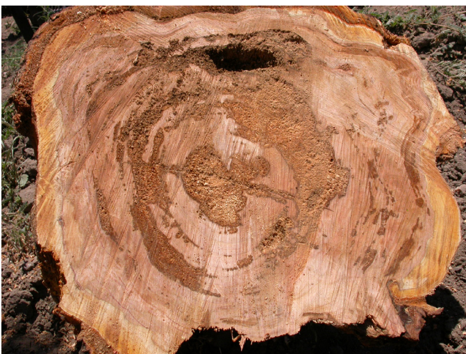
Fig. 4. Cross-section of crown of a sweet cherry tree showing circular pattern of prionus tunnels.

Sandy soils appear to favor prionus infestations. Not only is sand likely to increase the ease with which larvae can move about, but it allows rapid percolation of irrigation water. The loss of water from the soil profile combined with the tree's reduced ability to uptake water (due to prionus feeding) can become major stressors, even for well-established trees.