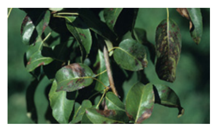
Spider mite injury to pear can cause rapid and severe leaf burn.

Spider mite injury to a tart cherry leaf; note stippling and debris caught in webbing on the leaf surface.