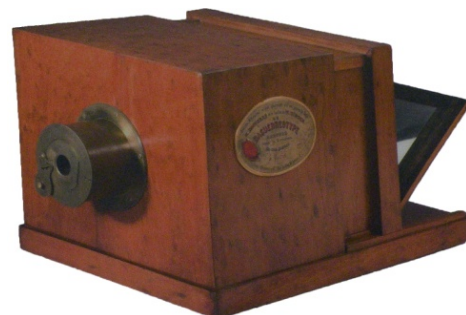
Figure 2. An early Daguerreotype Camera.

Light sensitive paper was developed in the early 1800s and photographs were taken using silver compounds to record an image. Early cameras were able to record images of still objects directly onto the paper, but the size of the picture was determined by the size of the film. The early commercial cameras, such as this Daguerreotype Camera, could not adjust the lens or enlarge photos from film.