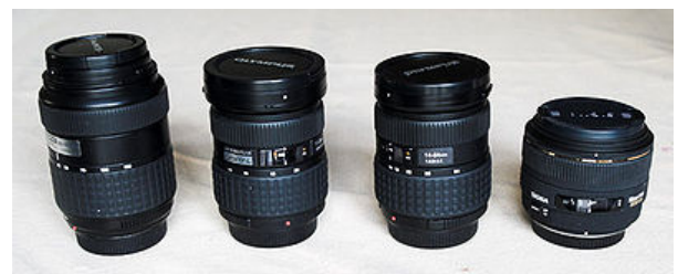
Figure 7. These lenses show the different types that are available for use in normal circumstances, telephoto, or wide angle.

Arguably, lenses may be the most critical component of the camera. The first lenses were mostly suitable for landscape photography. Improvements made it possible to take good portraits as long as the subject remained very still. During the 1860s the Single Reflex Lens (SLR) was invented. This lens made it possible for the same camera to use multiple types of lenses. The development of various compound lenses makes it possible to take telephoto, wide-angle, macro, and standard photographs. A good quality lens provides the photographer a lot of flexibility.