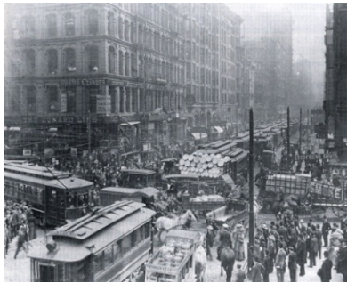
Figure 4. Downtown Chicago, IL, Circa 1880.

In the 1870s new advances in chemistry led to the ability to capture subjects in motion. Cameras were equipped with a fast moving shutter that could open and shut in a fraction of a second. It was now possible to capture the image of a crowded street such as this scene in Chicago in the 1880s.