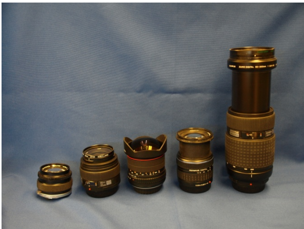
Figure 4. This photo shows different lenses. From left to right, 50mm prime lens ( f /1.4-16), 50mm 2:1 macro lens ( f /2.0-22), 8mm fisheye lens ( f /3.5-22), 14-42mm zoom lens (maximum aperture f /3.5-5.6), and 50-200mm zoom lens (maximum aperture f /2.8-3.5).

All lenses fall into the categories of prime lenses or zoom lenses. Prime lenses have a fixed focal length while a zoom lens has an adjustable focal length.