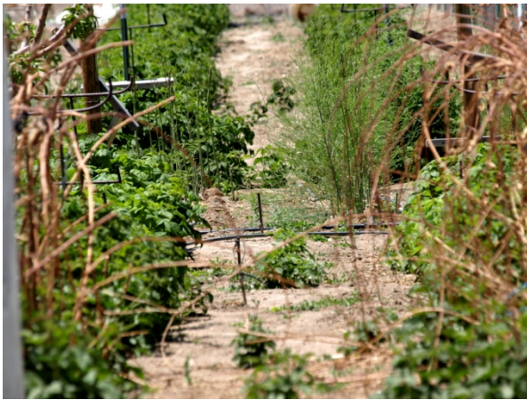
Figure 8. 200mm telephoto view This shot is clear through the end of the greenhouse door.