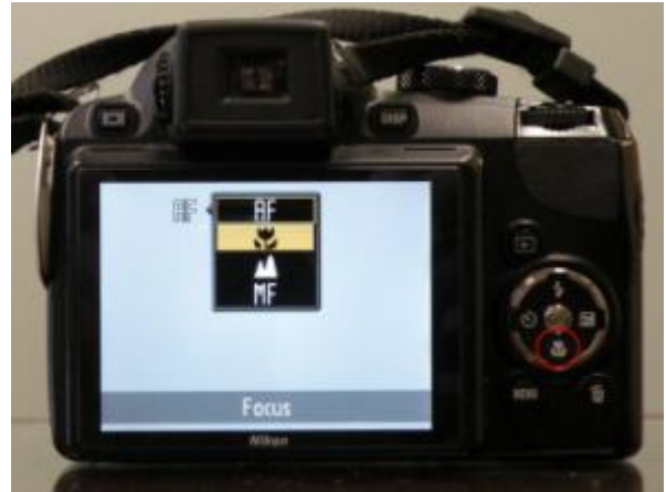
Figure 9. The macro mode setting that allows the camera to produce close-up shots.

symbol (Figure 9) and a mountain indicates settings for infinity or long-range shots.