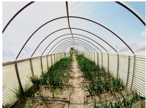
Figure 5. Fisheye view. Note how the sides of the structure seem to bow. This lens provides almost an 180° view.

The types of prime lenses include fisheye, macro, extreme wide angle, wide angle, normal angle, medium telephoto, and telephoto. Figures 5 to 8 were all taken from the same location and show the different perspectives offered by different focal lengths.