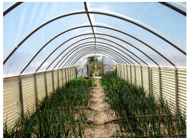
Figure 6. 14mm extreme wide-angle view. The sides are straight but the view begins further away from the photographer.