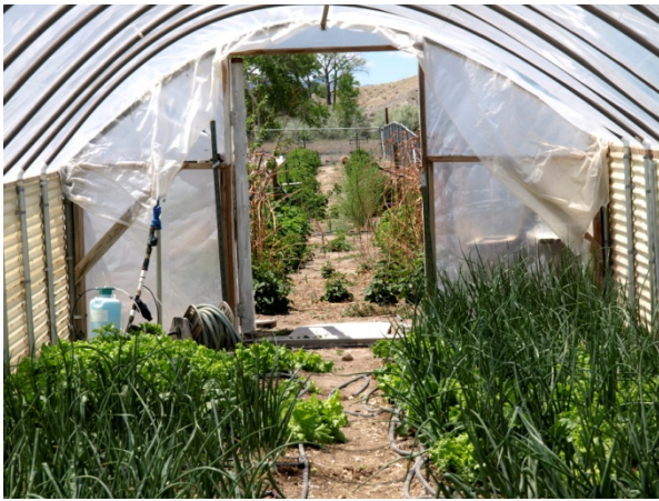
Figure 7. 54mm normal-angle view. Not as much of the view inside the greenhouse can be seen.