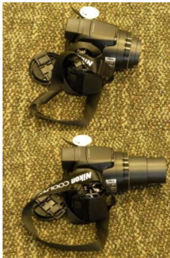
Figures 1 & 2. Figure 1 shows this camera at its minimum focal length of 4.7mm, while Figure 2 shows the 110mm maximum focal length.

the picture, such as wide angle, normal angle and telescopic view.