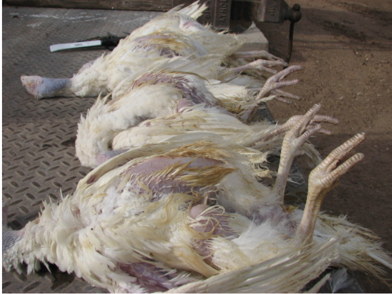
Figure 1. External examination of mortality. Examine for parasites, scratches, animal bites, and other signs of injury. Examine eyes, beak, nostrils for unusual growths (i.e., nodules or crusty material) or excess mucus. The application of soapy water helps mat the feathers, keeping them from interfering with the subsequent postmortem examination. Wetting the feathers in this manner also reduces the likelihood of aerosolizing disease-causing agents.

Figures 2 and 3. Breast exposed after pulling away skin and feathers. Cuts have been made on the inside of the thighs and the hip joints dislocated by slightly twisting the leg in order to expose the femoral head and allow legs to lie flat.